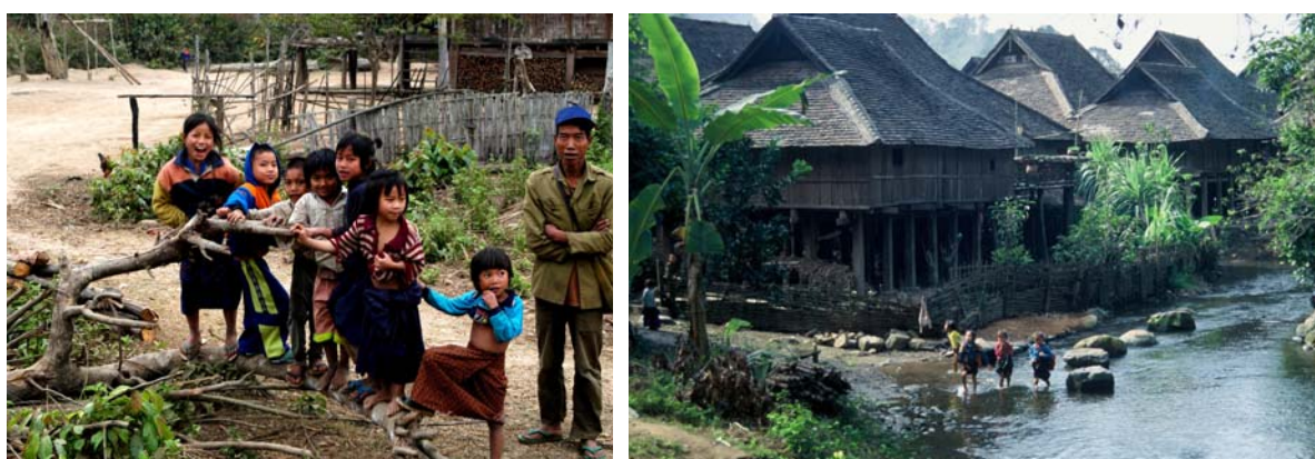
Fig. 3. Left: People of village of Yao. Right: Village and people of Dai. Southern Yunnan, China

A direct land connection between mainland SE Asia and Western Malesia existed until the early Pliocene (5 million years ago) and there was no geographical barrier to natural distribution of plants between mainland Southeast Asia and Western Malesia during most of the Tertiary [30]. The geological history of Southeast Asia could explain the Malaysian floristic affinity of the tropical seasonal rainforest in southern Yunnan.