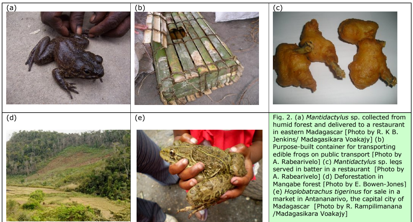
Fig. 2. (a) Mantidactylus sp. collected from humid forest and delivered to a restaurant in eastern Madagascar [Photo by R. K B. Jenkins/ Madagasikara Voakajy] (b) Purpose-built container for transporting edible frogs on public transport [Photo by A. Rabearivelo] (c) Mantidactylus sp. legs served in batter in a restaurant [Photo by A. Rabearivelo] (d) Deforestation in Mangabe forest [Photo by E. Bowen-Jones] (e) Hoplobatrachus tigerinus for sale in a market in Antananarivo, the capital city of Madagascar [Photo by R. Rampilimanana /Madagasikara Voakajy]

The demand for edible frogs in Madagascar comes mostly from restaurants that sell frogs' legs as culinary delicacies for snacks or first courses and is widespread across the island [2, 4]. Although a significant part of the supply comes from the introduced H. tigerinus [2, 4] our study has demonstrated that in Moramanga at least, there is regular collection of endemic edible frogs. Large size is the main criterion used by frog collectors in Madagascar (Fig. 2) and, although in Indonesia taste preferences have been reported for endemic over edible frogs [9], there is no evidence yet of this operating in Madagascar.