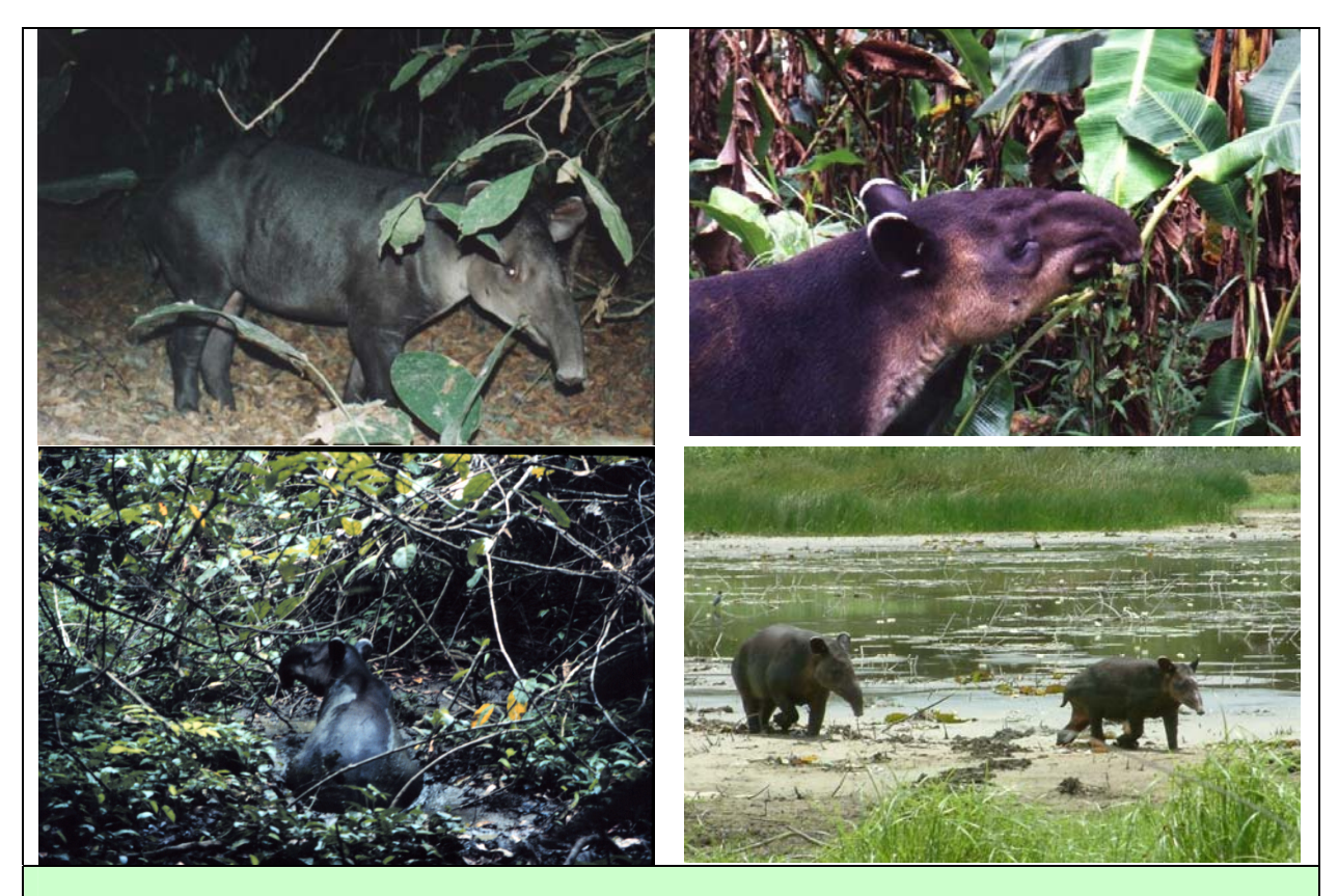
Fig. 2. Habitat, habits, and signs of Baird's tapir ( Tapirus bairdii ). A-C: tapirs in tropical rainforest of the Lacandon Forest, Chiapas. D: adult female tapir and her young in a waterhole of Calakmul, Campeche.

In the near future, it will be important to generate information about the age structure and sex ratios of tapir populations in other areas of Mexico. Knowing these variables may help to detect habitat or population management needs for tapir conservation, especially in non-protected areas where hunting is persistent.