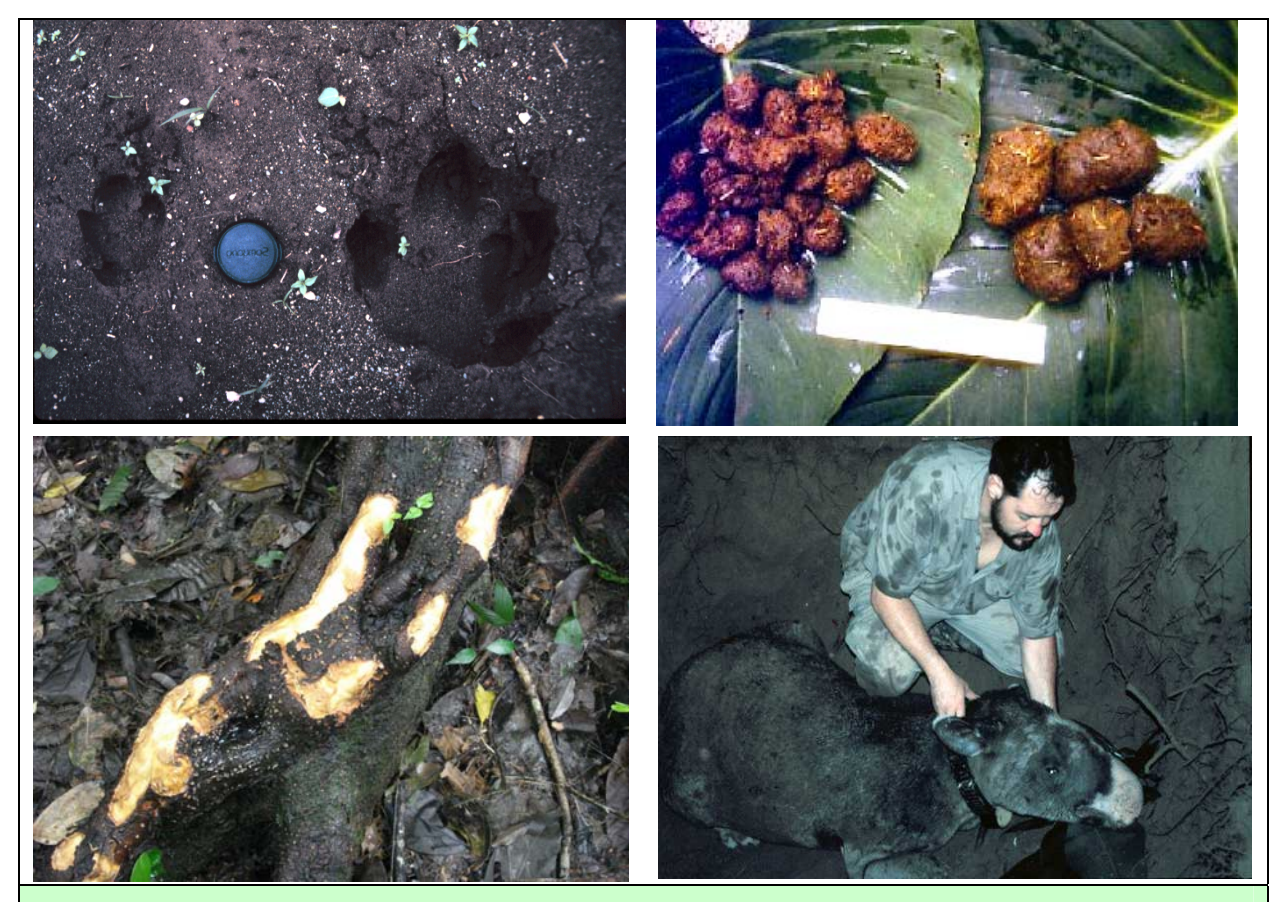
Fig. 3. Upper left and right: tracks and feces of adult female and young. Lower left and right: bark of Vatairea lundelii bitten by a tapir and tapir captured and radio-marked in the Lacandon Forest.