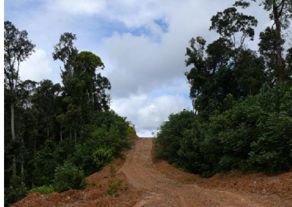
Fig. 2b. Piper aduncum remains absent along the new road in northern part of the concession

Regarding branch roads, P. aduncum occurred along Road “a” (constructed in 1997) but was absent on road “b” (constructed in 1998) where maintenance activities (including the slashing of plants on the edge of road) were being undertaken in preparation for timber extraction. In addition, we recorded two localized occurrences of P. aduncum on road “c” (constructed in 2006) leading to Mahak Village. These occurrences are at a direct (linear) distance of 82 and 88 km (and 148 and 155 km measured along the road) from Long Bagun at “Km 0”.