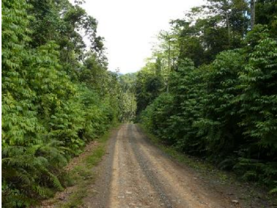
Fig. 2a. The dense cover of Piper aduncum along the old road in southern part of the concession