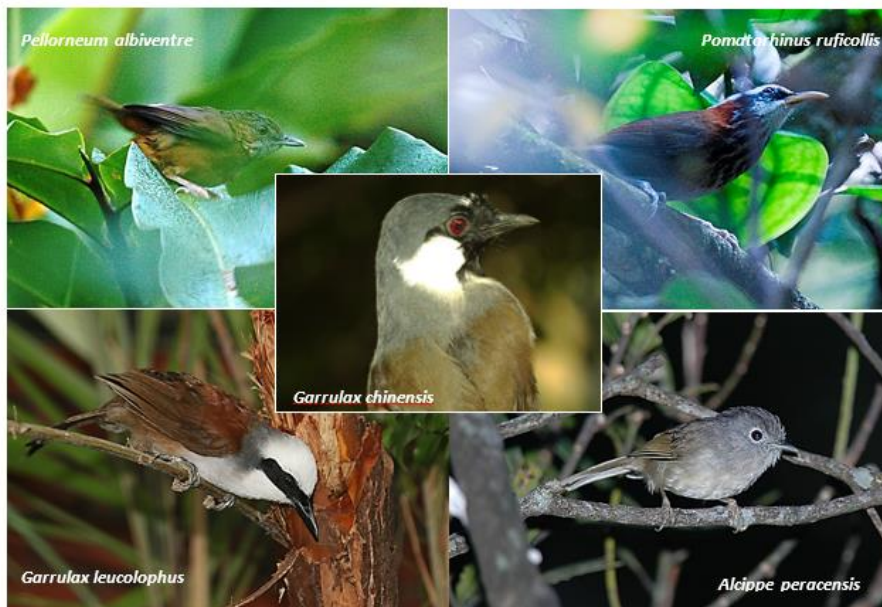
Fig. 3. Species of Timaliidae used in this study.

Another important finding of our study is that only 14-20% of predicted distributions overlap with protected areas, assuming that the land within these distributions inside protected areas is protected. Although these areas have been deemed "protected," Vietnam's management of national parks and nature reserves is centralized, creating a complex, bureaucratic system of administration in which the managing of the forests often falls into the hands of local and provincial authorities [30]. The effectiveness of these measures within parks and protected areas continues to be compromised by the large number of individuals living legally within the borders of these forests as well as the high levels of agriculture and human activity in close proximity to these regions. Poaching, logging, and resource acquisition from these protected areas are a major issue. Many populations and species abundances throughout Vietnam have declined dramatically since the end of the U.S.-Vietnam war, some even to extinction, due to these pressures [30–32].