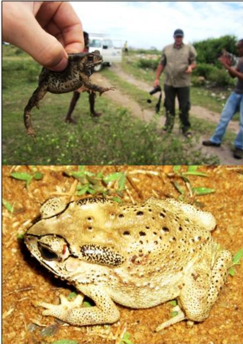
Fig. 1. The Asian toad in Toamasina showing its distinct appearance and size which is unique and unlike any other amphibian species in Madagascar.

A second series of social surveys were conducted from 8-16 October 2014 by eight ISSEDD students divided into four teams. The methodology was the same as the earlier surveys, except that geographic coordinates were recorded using a Garmin GPSMap 60CSx GPS unit, the surveyors omitted question #3, and multiple residents were interviewed per site.