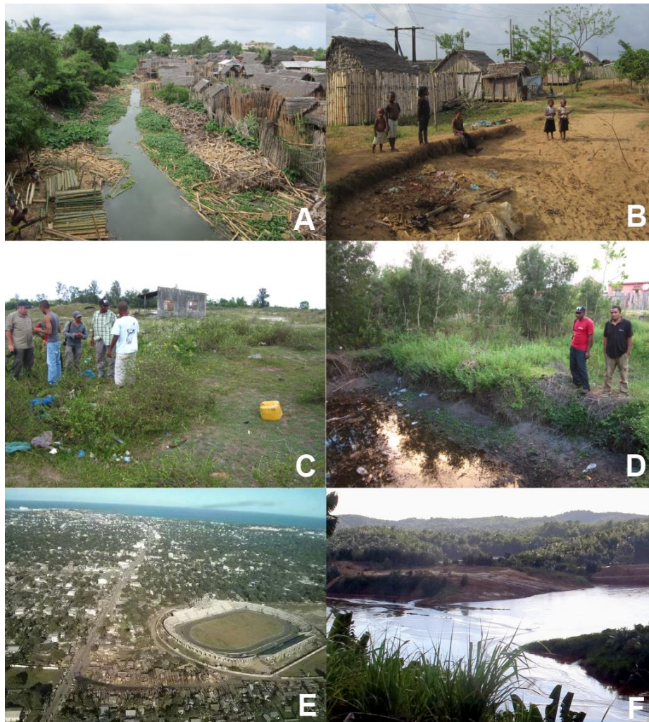
Fig. 2. The range of habitats where the Asian toad occurs around Toamasina. A) A waterway running through the city. B) Garbage pile and housing on outskirts of town. C) Grassy field and debris near center of distribution south along National Route 2. D) Temporary pond and surrounding scrubby vegetation around housing near industrial area south of the city. E) Aerial view showing a portion of the northeastern distribution of the toad. F) Rural land, Eucalyptus forest, and river in the southern portion of the known distribution.

The farthest point south that the toad was detected was Ambokarivo in Mahatsara (S18.28533; E49.32468) and the farthest north at a site approximately 500 meters north-northeast of Barikadimy (S18.13043; E49.37845). The toad was confirmed within less than 1 km of the ocean to the east, while the western-most points were Ambatavia (S18.19786; E49.29832) and Morafeno 2 (S18.15126; E49.30281), both located near the Ambatovy Tailings site. The toad was not detected near the center of the city, towards the airport, or farther north along National Route 5, or on National Route 2 south from Antanambao to Sandrangetana. Tracing the smallest possible convex polygon around the outermost sites of detection provides a minimum area of occupancy of 108 km 2 , with the centroid located along Route National 2 at S18.19206 E49.34256, approximately 1 km west of the Ambatovy Plant and the railway that runs south from the port through this area (Fig. 3 and Fig. 4).