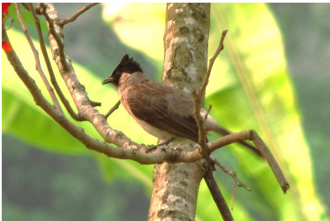
Fig. 3. Sooty-headed Bulbul ( Pycnonotus aurigaster ) at Xishuangbanna Tropical Botanical Garden (XTBG), Yunnan, China; photo credit: Rachakonda Sreekar.