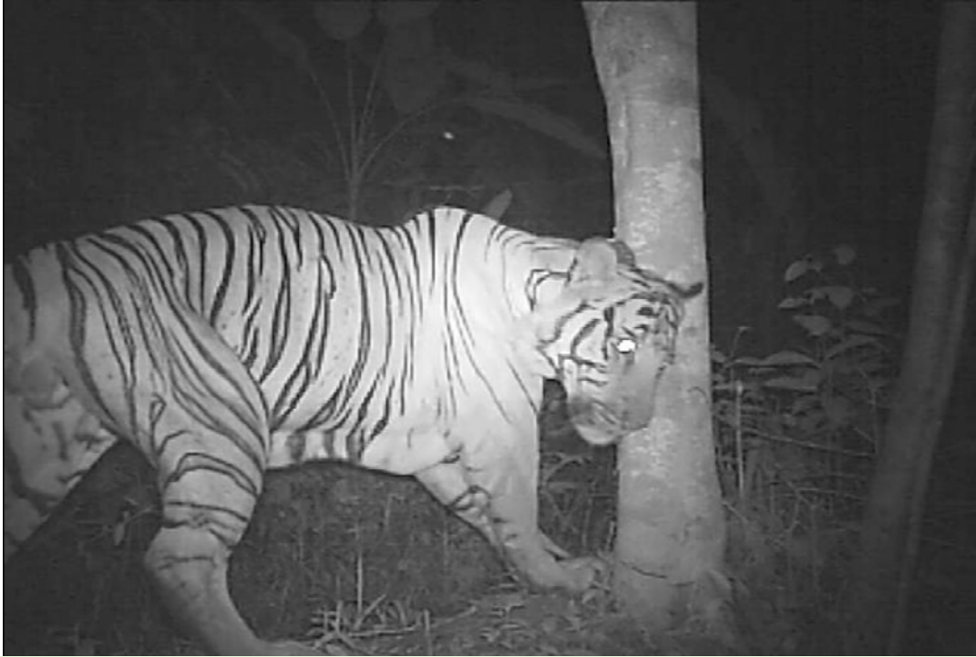
Fig. 3. An adult male tiger ‘cheek rubbing’ on one of the hair traps in the study.