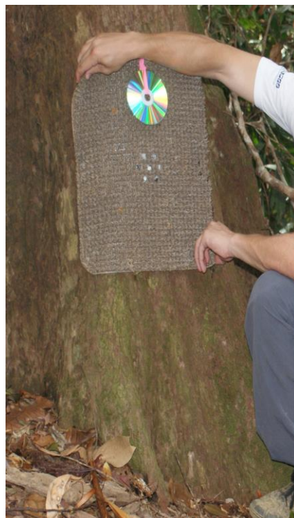
Fig. 2. An example of one of the scent-baited hair traps used in the study, designed to target felids.

For the first design we attached traps to the ground to target Dholes ( Cuon alpinus ), the only canid known to be present in the landscape-; studies conducted on other canids such as Dingoes ( Canis dingo ) in Australia successfully obtained hair samples using this design [18, D. Marrant, unpublished data]. For the second design, we attached traps to trees (Fig. 2), targeting six known felids in the landscape: the Malayan tiger ( Panthera tigris jacksoni ), leopard ( Panthera pardus ), clouded leopard ( Neofelis nebulosa ), golden cat ( Pardofelis temminckii ), leopard cat ( Prionailurus bengalensis ) and marbled cat ( Pardofelis marmorata ). The rationale for placing traps on trees was to prevent the traps from appearing as 'foreign ground objects' to felids, and to facilitate cheek, head, and neck rubbing, which are commonly observed scent-marking behaviours in felids [19,20]. A blank compact disc (CD) was added approximately 10-30 cm above the scent packet as a visual attractant [sensu 21].