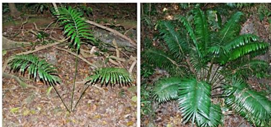
Fig. 2. Six-year-old Guam Cycas micronesica plants growing in off-site germplasm collection in Tinian Island, revealing example of plants that exhibit minimal growth rates but otherwise appear healthy (left), and example of plants that exhibit robust growth rates (right).