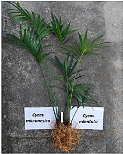
Fig. 3. General appearance of healthy Cycas micronesica and Cycas edentata seedlings that were bare-rooted after being grown with root competition from February to December 2014. White arrow points to coralloid root clusters within which cyanobacterial endosymbionts fix nitrogen.