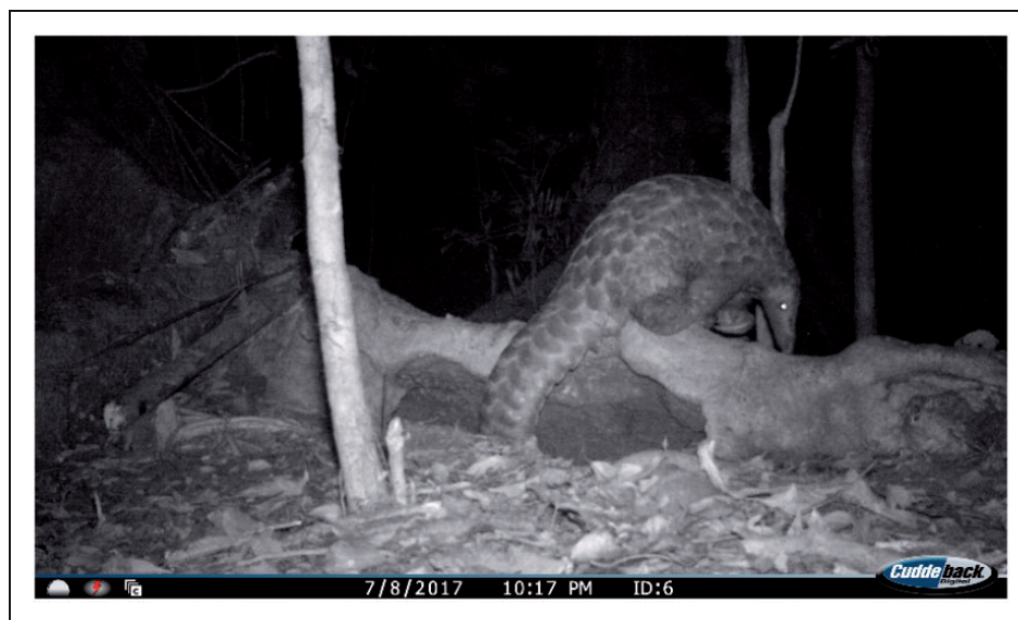
Figure 2. Giant pangolin photographed by camera trap leaving a burrow at Bouamir Research Station in the Dja Biosphere Reserve, Cameroon.

One camera trap out of nine at eight localities (two burrow entrances were associated with a single tree) photographed a pangolin at a burrow in this survey (Figure 2). The burrow was adjacent to a tree located on a northeast facing slope at the edge of a swamp. The tree had multiple burrow entrances around its trunk and roots, and cameras were placed to capture