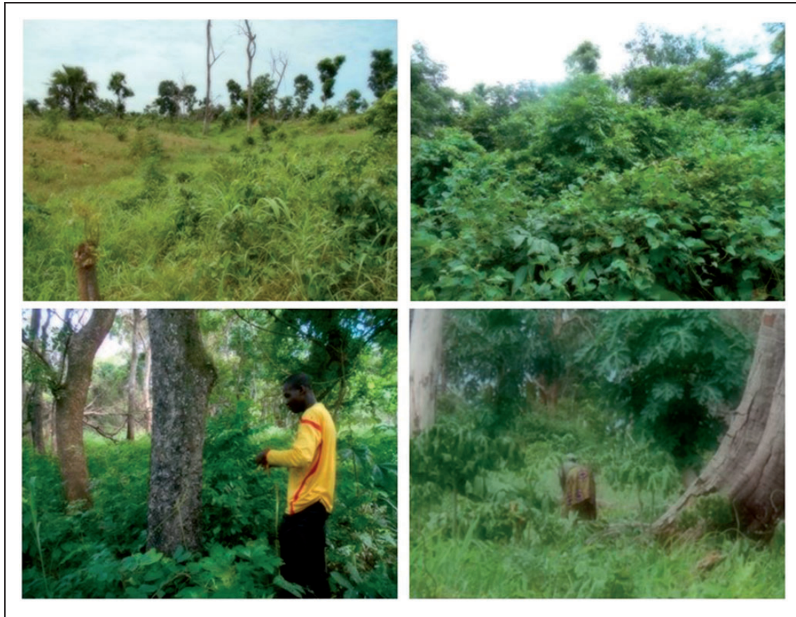
Figure 2. Photographs of the Legu, Sabi, and Kala community forests. Top left: Remnants of a “yaa” from the time of the slave trade, located in the Legu Forest. These ditches, filled with spikes and hidden with brush, were used to trap kidnappers. Top right: Patch of regenerating secondary forest in the Sabi Forest. Bottom left: Technician collecting data in the Kala Forest. Bottom right: A woman clearing brush in the Legu Forest.

Kaboli were less degraded and had a higher ecological value than a similar community forest (the Legu Forest) that did not contain a sacred site. The Sabi and Kala Forests had significantly higher percentages of tree cover within their historical boundaries than the Legu Forest. In addition, the most frequently encountered species within the Sabi and Kala Forests were species associated with deciduous dry forests while the most frequently encountered species in the Legu Forest were introduced plantation species and species associated with savanna habitat. While the species richness in the Sabi Forest was not significantly higher than the Legu Forest, the Kala Forest did have significantly higher species richness. With respect to two other measures of biodiversity, the Shannon and Berger–Parker diversity indices, both the Sabi and Kala Forests were significantly higher than the Legu Forest. Average AGB was more than four times higher in both the Sabi and Kala Forests than in the Legu Forest.