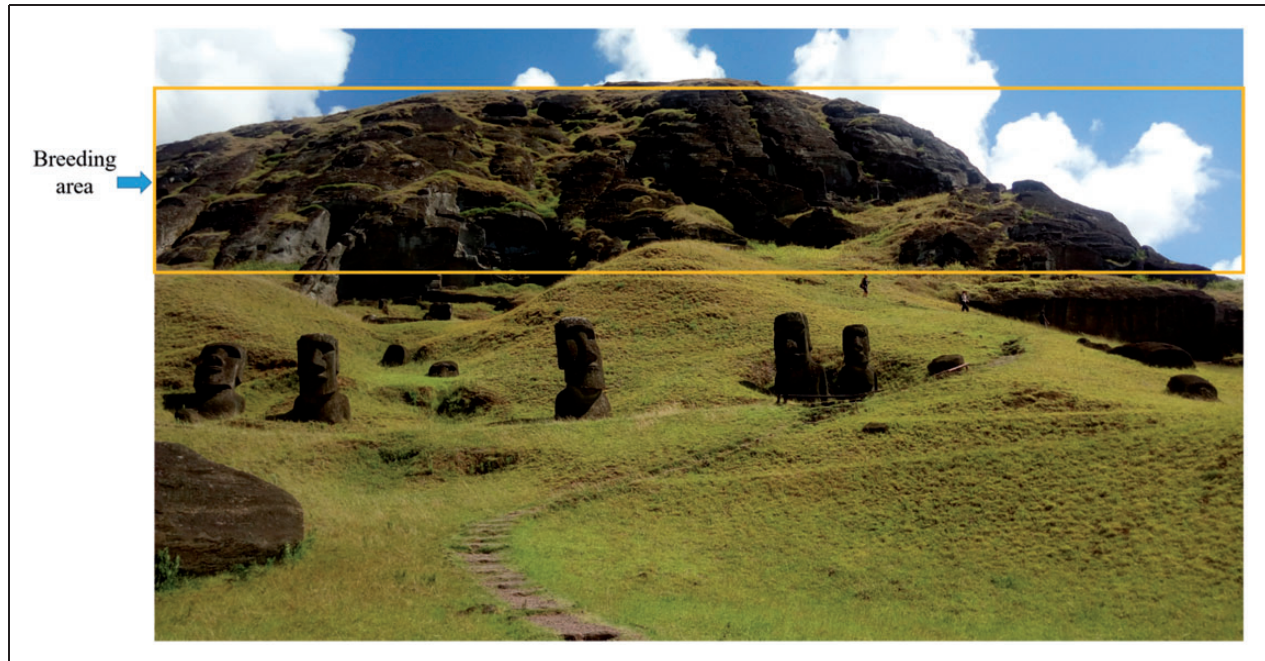
Figure 1. Rano Raraku volcano at Rapa Nui. The square indicates part of the breeding area that was surveyed and where experimental eggs were placed at empty red-tailed tropicbird nests.