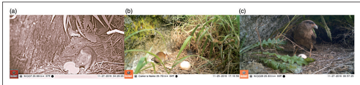
Figure 3. Potential predators recorded visiting simulated unattended eggs in nests of the red-tailed tropicbird, Phaethon rubricauda . (a) Brown rat Rattus norvegicus , (b) Polynesian rat Rattus exulans , and (c) Chimango Caracara Phalcoboenus chimango .