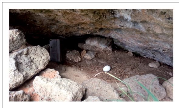
Figure 2. One of the empty red-tailed tropicbird nests at Rano Raraku used in this study showing an experimental egg and a Bushnell Camera Trap.

were empty but recently used as confirmed by the presence of feces, down, and feathers (personal observation). On November 20, 2016, three hen eggs of free-living birds raised at Rano Raraku were placed in three of the empty nests (one egg per nest). Each experimental egg was monitored by a Bushnell Camera Trap settled in each nest to record the visits and behavior of potential predators (Figure 2). The following day, nests were checked in the morning and evening to attempt to determine diurnal and nocturnal predators. None of the eggs were depredated. After each inspection, eggs and cameras were changed to other nests. On the second day, the same procedure was performed. Again, none of the eggs were depredated. Therefore, on the third day, eggs and cameras were