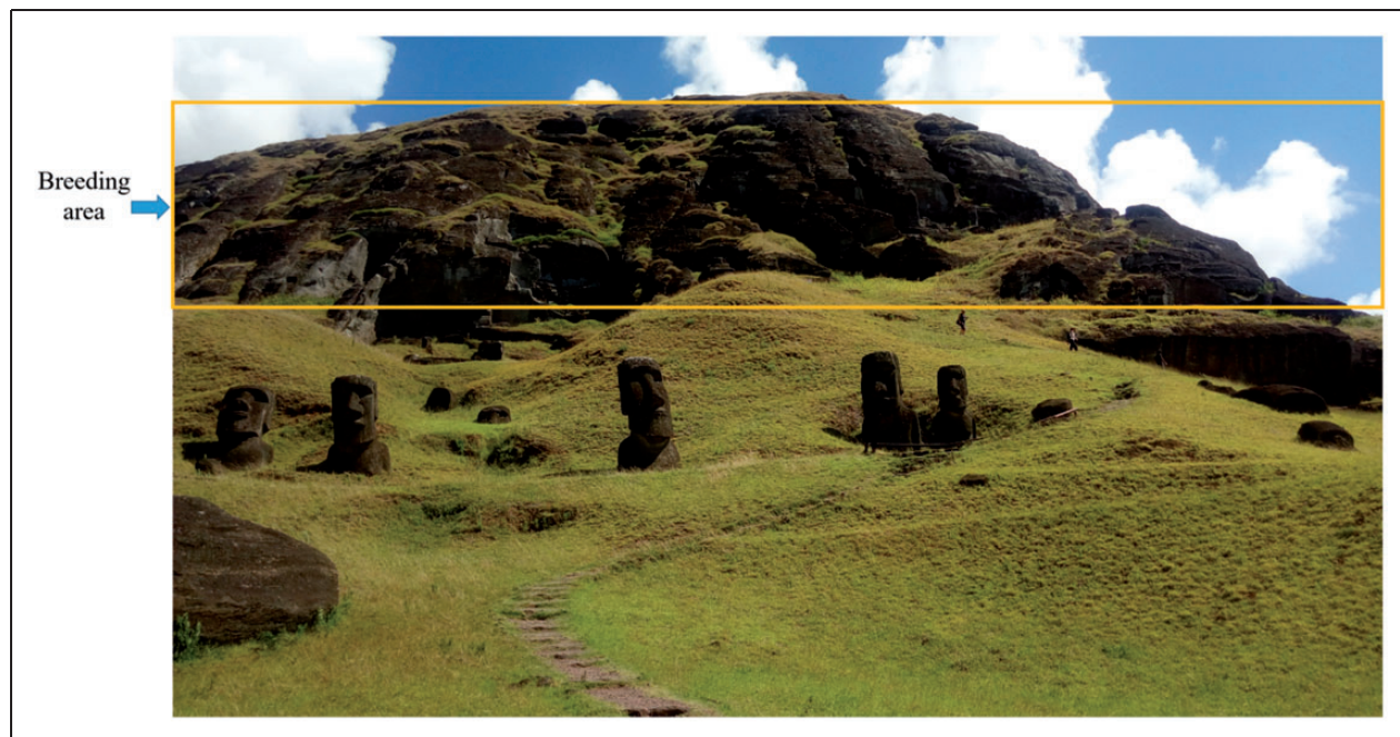
Figure 1. Rano Raraku volcano at Rapa Nui. The square indicates part of the breeding area that was surveyed and where experimental eggs were placed at empty red-tailed tropicbird nests.