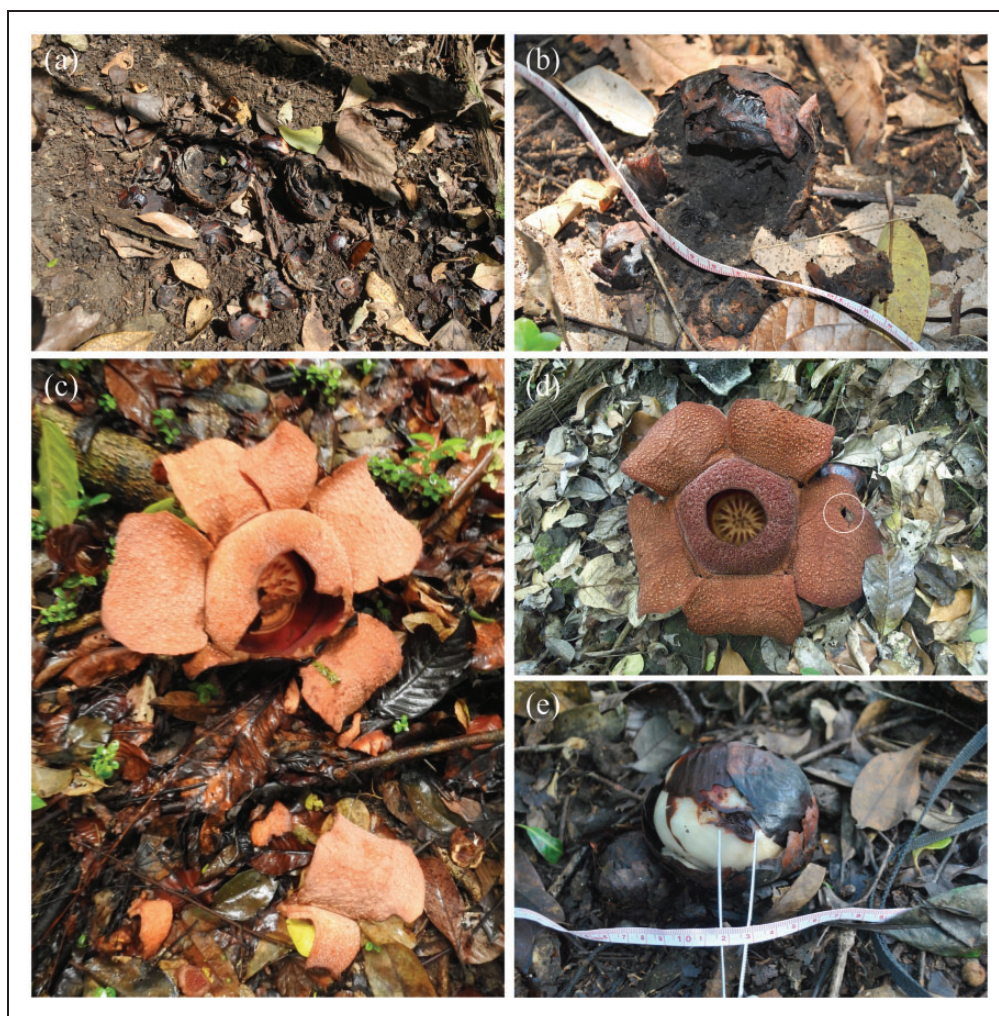
Figure 3. Some damages were found on the flower of three Rafflesia species in Java. (a) Remaining parts of Rafflesia zollingeriana after eaten by animals; (b) decayed bud of Rafflesia patma , partially eaten by animals; (c) R. patma with broken perigone lobes, likely caused by animals; (d) minor damage on the perigone lobe of the R. zollingeriana (white circle); and (e) wasp larvae was found inside the bud of R. rochussenii .

pollinator visitation rate through flower damage, although this has not been confirmed. Both direct and indirect effects can negatively impact on the maternal fitness of Rafflesia species (Kelly, Ladley, Robertson, & Crowfoot, 2008). The flower mortality rate in Rafflesia has been estimated to be between 50% and 90% and is mostly attributed to flower bud predation (Nais, 2001), indicating that flower predation is one of the most important factors that affects the persistence of Rafflesia populations in the wild. Therefore, it is crucial that predator populations are considered when developing conservation strategies for Rafflesia species.