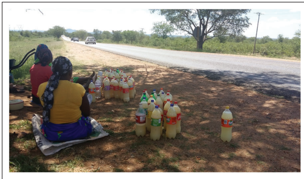
Figure 2. Local communities selling marula beers along Punda Maria road going to Kruger National Park.

This study provided an opportunity to quantify the role of local communities in conserving S. birrea . The results of this study showed that respondents had good knowledge about S. birrea and that the species has a positive impact on the lives and livelihoods of local communities.