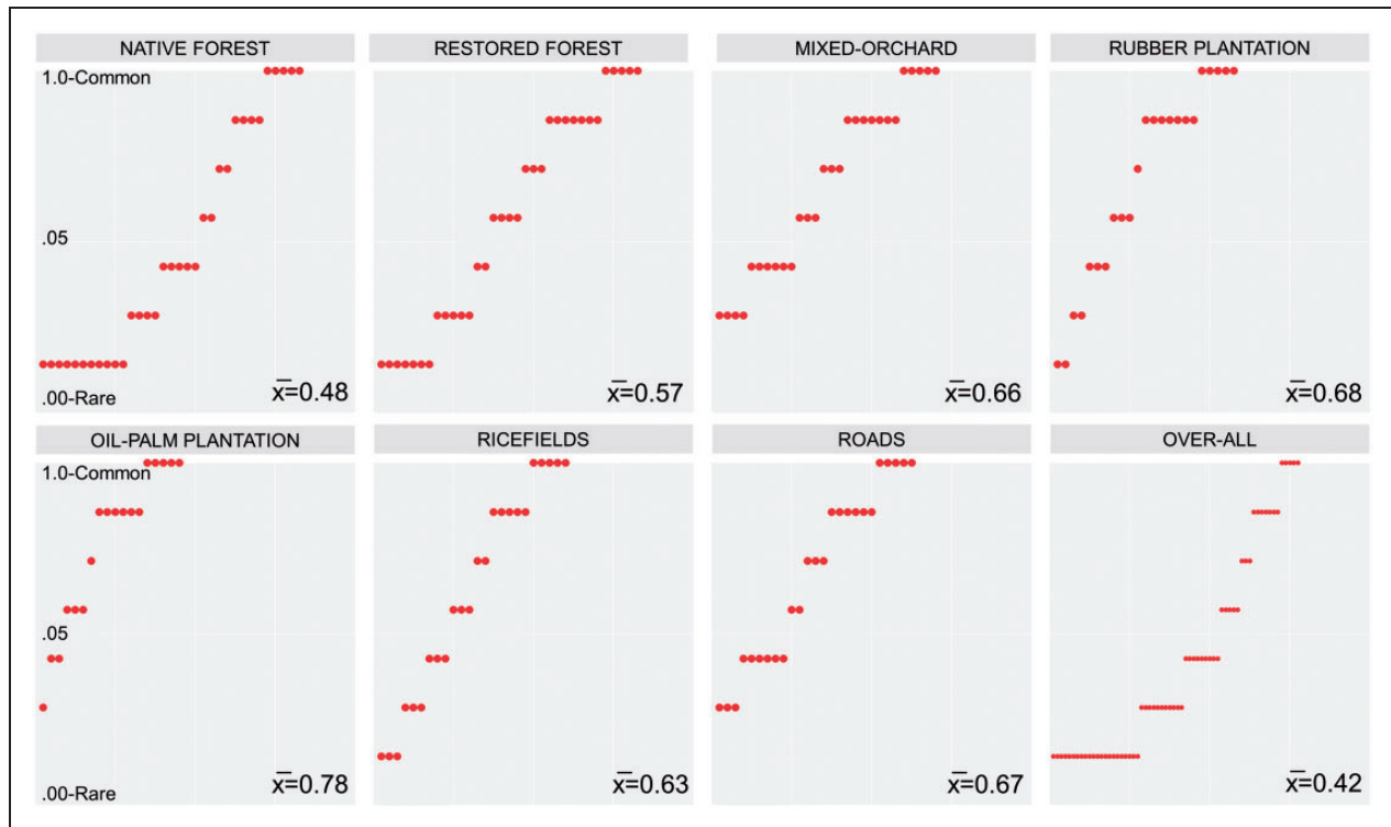
Figure 3. Species rarity (commonness) across different habitat types. Species (red dots) near 1 indicates the species was recorded in all habitat types (common). The mean species rarity (commonness) index (site) is shown.

ecosystems, for example, native forest and restored. Finally, in terms of similarity in feeding groups composition, native forests and restored has the highest similarity at 80%.