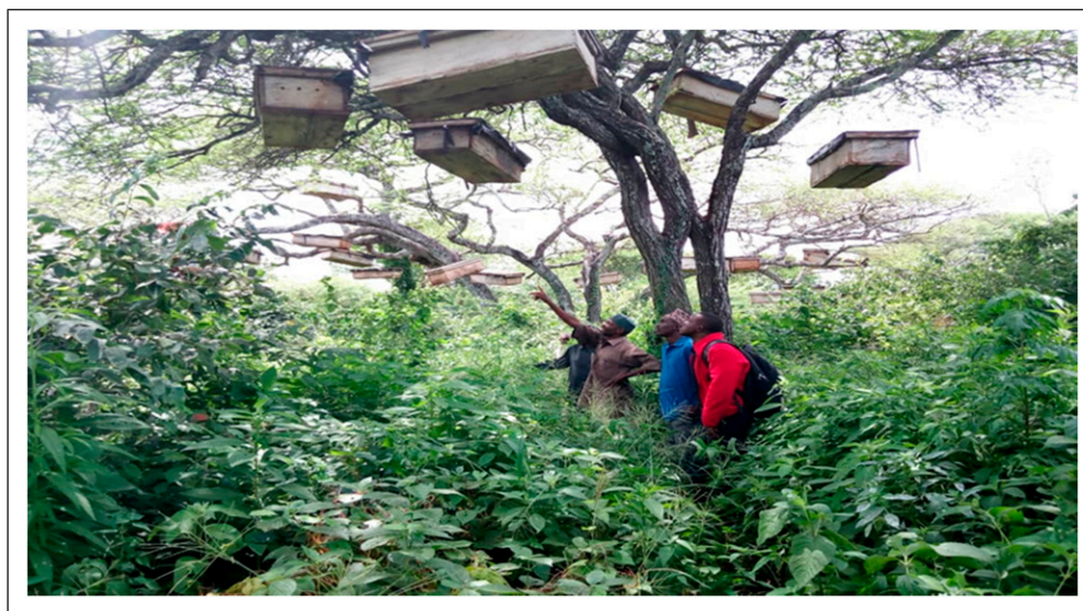
Figure 2. An apiary with hanging frame beehives covered by vegetation.

adoption of the hanging frame hives technology in the region. Moreover, many factors were contributing to community preference for log beehives. The focus group discussions revealed that hanging frame beehives were expensive compared to log beehives. A hanging frame beehive was priced from TZS 80,000 to TZS 120,000 (34.45–51.68 USD), which hindered beekeepers from adopting and using the technology. Apart from the perceived high costs of hanging frame beehives, tradition was another important aspect mentioned during discussions. It was further revealed that tribes such as Sandawe and Rangi preferred to use log beehives due to their cultural values and norms, such that traditional beekeeping is a way of honouring ancestors. The system has become part of their daily family life, making it difficult to adopt hanging frame beehives as it will go against their norms. These ethnic groups are