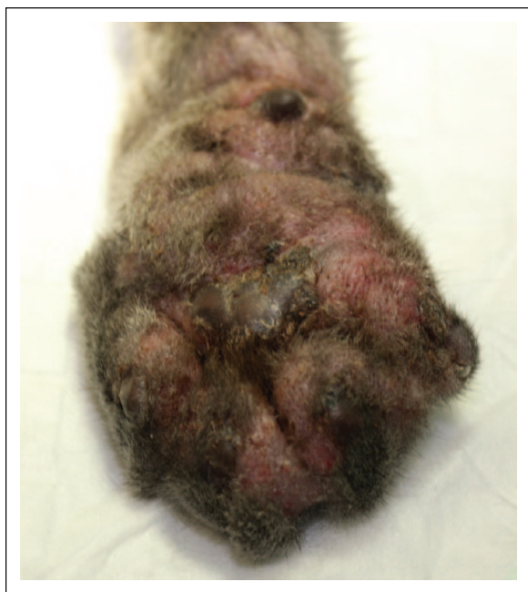
Figure 3 Case 2, ventral aspect of the right forelimb. Note erythema, oozing and swelling

the chin. After 6 weeks, antibiotics were discontinued and ciclosporin A (Atopica; Novartis) was started at 7 mg/kg q24h. Prednisolone was tapered and then stopped; hypoallergenic diet was maintained. During the daily regimen of ciclosporin, the limb lesions regressed, the chin swelling persisted and ulcerative lesions appeared in the labial region, associated with pain and dysorexia. Oral clindamycin (Antirobe; Zoetis) at 11 mg/kg q24h for 20 days and meloxicam (Metacam; Boehringer Ingelheim) at 0.05 mg/kg for 5 days improved the cat's discomfort. The labial lesions regressed and ciclosporin was given q48h. The dietary re-challenge was negative; however, as ciclosporin had not been discontinued, a dietary-triggering factor could not be ruled out. During the following months, the initial pedal lesions resolved but other eosinophilic lesions appeared randomly on the face, chin, feet and in the oral cavity, and regressed spontaneously. Ciclosporin was stopped and selamectin was maintained monthly.