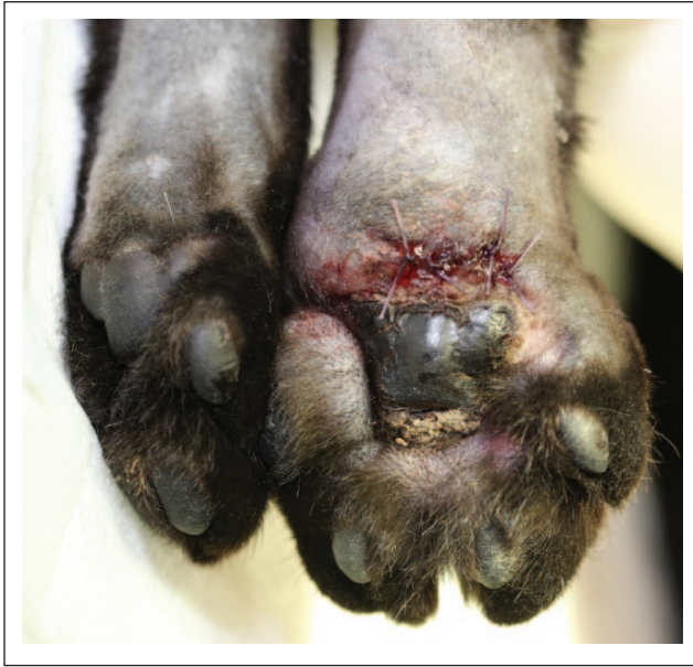
Figure 1 Case 1, ventral aspect of the left hindlimb. The picture was taken after having performed the biopsies

skin biopsies revealed a nodular-to-diffuse dermatosis, predominantly mastocytic and eosinophilic. Plasma cells, histiocytes, lymphocytes and a few foci of eosinophilic furunculosis were also observed (Figure 2a–d). Based on these results, a presumptive diagnosis of pedal ED with secondary bacterial infection was considered.