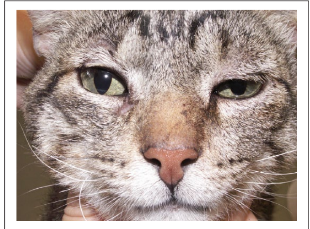
Figure 4 Blepharitis had completely resolved 1 month after treatment. Small scars can be noted in the upper and lower lids

acid (12.5 mg/kg, Nisamox; Norbrook Laboratories), permethrin, nystatin, triamcinolone acetonide and neomycin sulfate ear ointment (Oridermyl; V etoquinol) and imidacloprid/moxidectin spot-on application (Advocate; Bayer). Blepharitis and otitis were completely resolved 1 month after onset of treatment (Figure 4). Three months later the antifungal therapy was suspended. At this time the cat appeared clinically normal.