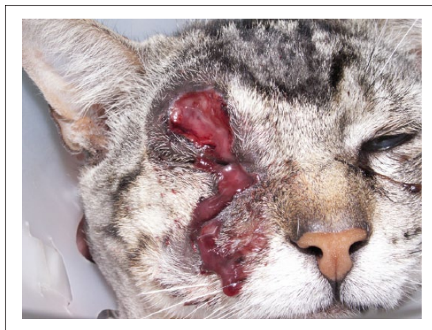
Figure 1 Mucopurulent discharge from an open wound in the right upper and lower lids

On physical examination, fever and bilateral parasitic otitis due to Otodectes cynotis were detected. In addition, ophthalmological examination revealed mucopurulent discharge from the upper and lower lids. Slit-lamp biomicroscopy showed a normal anterior segment. Intraocular pressure, measured by applanation tonometry (Tono-Pen Vet; Medtronic Solan), was within the normal reference interval (10 mmHg in OD and 11 mmHg in OS; reference interval 20–25 mmHg). No fundoscopic alterations were detected in either eye by direct and indirect ophthalmoscopic examination. Based on these findings, blepharitis was diagnosed. The differential