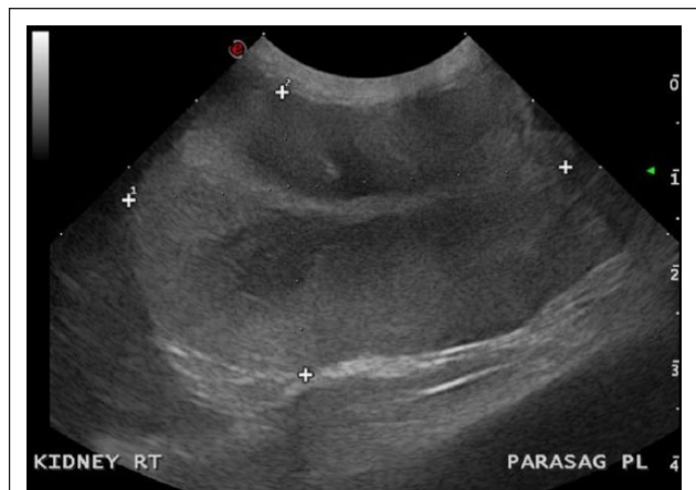
Figure 1 Ultrasonographic image of the right kidney in the parasagittal plane of a cat with histoplasmosis and renal involvement

neutrophils and a mixture of lymphocytes, plasma cells and macrophages. Serum and urine were submitted for Histoplasma antigen enzyme immunoassay (EIA) ( Histoplasma Quantitative EIA Test; MiraVista Diagnostics). No antigen was detected in the urine but antigen was detected in the serum (3.16 ng/ml; RI none detected). Itraconazole was prescribed at 10 mg/kg/day by mouth. To treat inflammation associated with dying H capsulatum organisms, prednisolone was prescribed at 0.8 mg/kg/day by mouth and tapered over 21 days. Mirtazapine was prescribed at 3.75 mg total dose by mouth every 48 h for appetite stimulation.