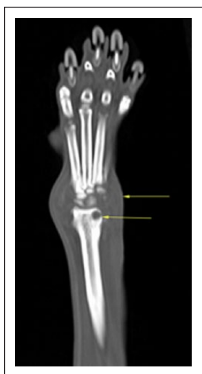
Figure 3 Dorsal multiplanar reformatted image of the left carpus of case 2. There is marked soft tissue swelling identified associated with the antebrachio-carpal joint (arrow). Smooth periosteal new bone is identified along the medial aspect of the distal radius. Marked osteolysis is identified, and particularly obvious in the lateral aspect of the distal radial epiphysis (arrow)

within the distolateral aspect of the radius and the inter-mediatoradial carpal bone consistent with osteolysis. Differential diagnoses included osteomyelitis/erosive arthritis (fungal, bacterial), atypical immune-mediated arthritis, mycobacterial infection and soft tissue neoplasia (eg, synovial cell sarcoma). CT of the right carpus was unremarkable. Enlargement of the left axillary lymph node was noted on CT, which was thought to be consistent with reactive or metastatic change. CT of the thorax revealed no abnormalities.