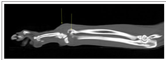
Figure 2 Sagittal multiplanar reformatted image of the left carpus of case 2. There is marked soft tissue swelling associated with the antebrachio-carpal joint. Osteolysis of the distal radius is also identified (arrows)