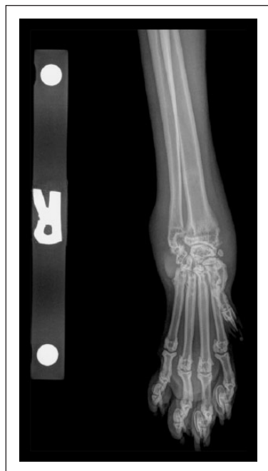
Figure 5 Dorsopalmar radiograph of the right antebrachiocarpal joint of case 4. There is marked soft tissue swelling associated with the antebrachiocarpal joint, as well as a smooth periosteal reaction along the distal radial metaphysis on the medial and lateral aspects. Focal regions of osteolysis are present within the medial aspect of the distal radial epiphysis

positive for M tuberculosis complex, confirmed to be M microti on GenoType MTBC assay (Leeds Teaching Hospitals Trust, Department of Microbiology).