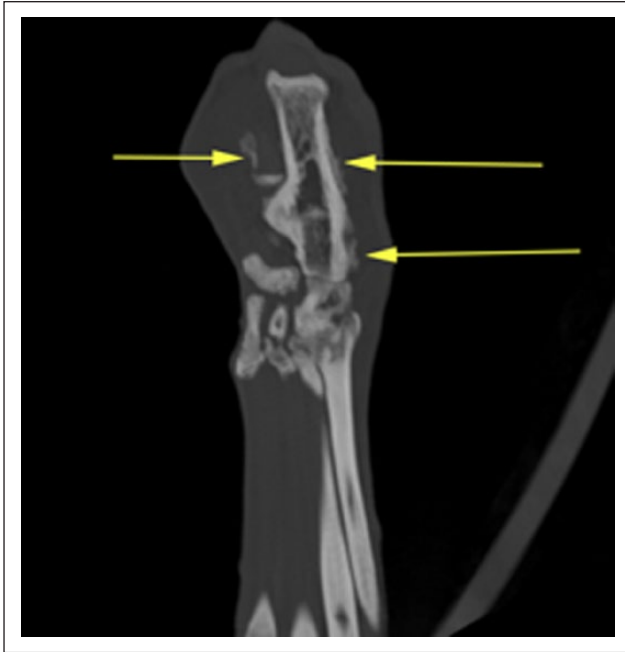
Figure 1 Dorsal multiplanar reformatted image of the left tarsus of case 1. A moderate periosteal reaction as described is identified (arrows)

around the talocrural joint (Figure 1). The lesion appeared intimately associated with the synovium. There were multiple pockets of non-contrast-enhancing soft tissue-attenuating material within the mass. CT of the chest revealed consolidation of the ventral aspect of all lung lobes. The consolidation occupied up to approximately two-thirds of each lung lobe. Air bronchograms were identified at the dorsal aspects of the regions of consolidation. The tip of the left cranial lung lobe was characterised by emphysematous changes. There was scant heterogeneous mineralisation of the lateral aspects of the right caudal lobe. There was also a mild tracheobronchial lymphadenopathy. These changes may have been consistent with previous severe liquid paraffin aspiration; however, concurrent disease (mycobacterial pneumonia) was also possible.