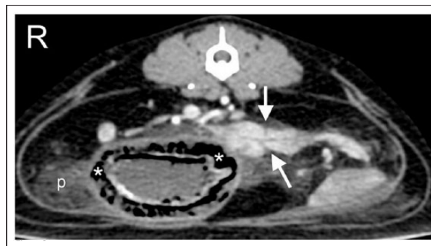
Figure 2 Abdominal CT. There are a few linear hypodense lines crossing the pancreas (arrows) and a small amount of peritoneal fluid (p). The asterisks represent gas within the gastric wall, within the submucosa

CT of the thorax and abdomen was performed. The thoracic images were considered normal. The abdominal images showed a small amount of peritoneal fluid and a few small gas bubbles within the peritoneum located