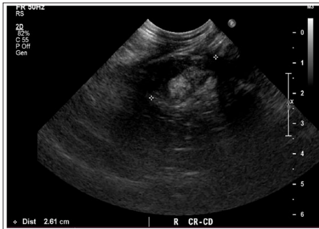
Figure 4 Thoracic ultrasound image depicting a hyperechoic structure in right caudal thorax, in contact with the diaphragm. There is moderate pleural effusion ventral to the structure

in some areas appeared to be arising from it. Differential diagnoses for the structure included: a neoplastic mass arising from the liver, gall bladder or peritoneal space; a displaced and abnormal gall bladder secondary to neoplasia, cholecystitis or rupture; or a neoplastic or torsed liver lobe.