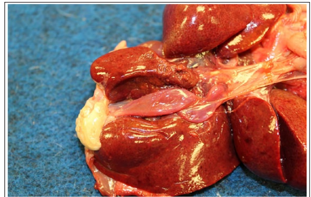
Figure 6 Necropsy image. Visceral surface of the liver with abscessed tissue at left connecting deflated gall bladder and diaphragm

An aggressive neoplastic or infectious lesion of the biliary tree with focal diaphragm destruction was suspected. Although a traumatic gall bladder herniation through a diaphragmatic tear with subsequent strangulation and necrosis could not be excluded, it was considered less likely based on the patient's history. As the cat was unstable under anesthesia and an aggressive lesion was suspected, the owner elected humane euthanasia rather than pursuing further intervention.