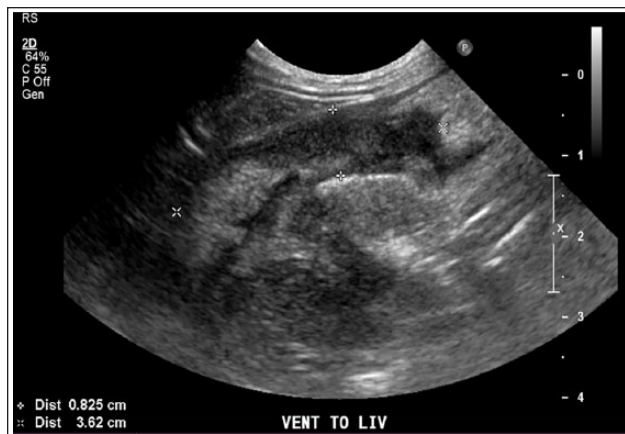
Figure 3 Abdominal ultrasound image depicting tubular structure ventral to and, questionably, arising from the right liver

mal parameters, but a mature neutrophilia ( 23.0 \times 10^9/l ; RI 2.6–15.2 \times 10^9/l ) had arisen. The cat began eating small amounts voluntarily and no further respiratory distress had occurred. The medications were continued for five more days, until the cat again became anorexic and lethargic. At that time, a urinalysis revealed bilirubinuria and serum biochemistry analysis identified moderate total hyperbilirubinemia (10.0 \mu\text{mol/l} ). A CBC revealed a progressive mature neutrophilia ( 30.0 \times 10^9/l ). The following day the cat became severely dyspneic, and thoracic radiographs revealed moderate right-sided pleural effusion (Figure 2). Thoracocentesis yielded a thick yellow–orange fluid, and in-house cytological evaluation of the fluid revealed leukocytes without evident bacteria. The dyspnea improved following the thoracocentesis procedure. Overnight hospitalization with buprenorphine, amoxicillin–clavulanic acid and furosemide was pursued, and the cat was referred the following day.