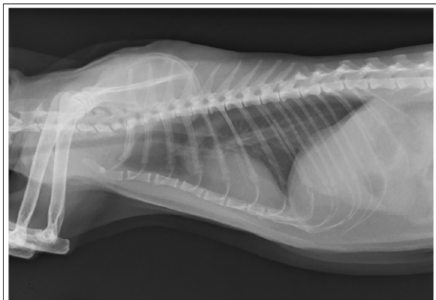
Figure 1 Right lateral thoracic radiograph depicting normal thorax at initial presentation to the primary veterinarian despite acute dyspnea