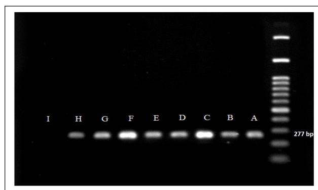
Figure 1 Agarose gel electrophoresis stained by ethidium bromide producing 277 base pair fragments for PKD1 mutant genes (A and B = positive control; C to H = PKD1 mutant genes; I = negative control)

Twenty-two cats (46.8%) were diagnosed as heterozygous for the mutant gene by PCR (Figure 1).