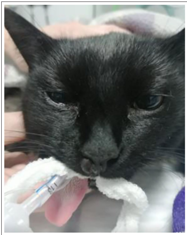
Figure 1 Mass prior to initial treatment; it was 7 mm in diameter and affected the right side of the nose, just distal to the planum

Bleomycin was injected intravenously as a bolus at a dose of 20 mg/m 2 . Pulses were generated using an electroporator certified for veterinary use (Onkodisruptor). Contact between the patients and the electrodes (M1 clamp electrodes; Onkodisruptor) was optimised using an electroconductive gel. Five minutes after the chemotherapy injections, the sequences of eight biphasic pulses (two phases of 50 µs given in each pulse of electricity) were delivered in bursts of 1200 V/cm.