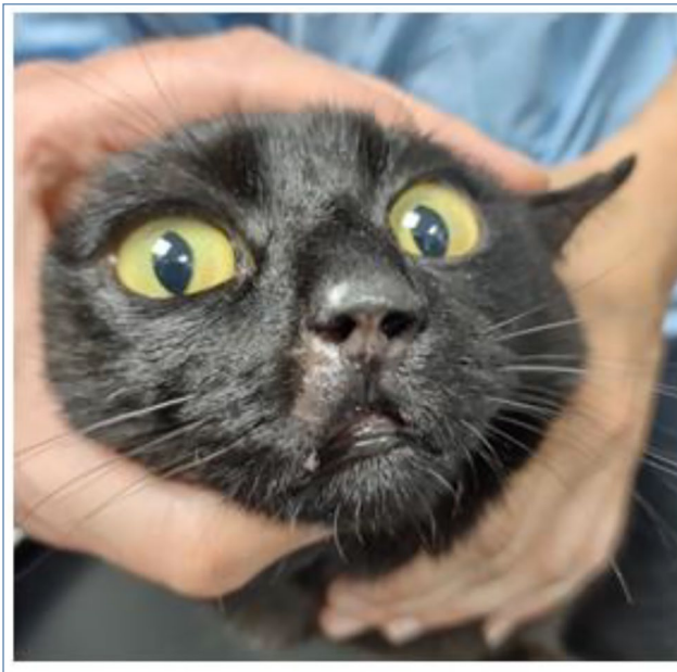
Figure 4 Six months after electrochemotherapy treatment. There is a local area of alopecia and mild thickening of skin at the site

In humans, the incidence of melanoma has been increasing over the last 50 years. Despite accounting for <5% of cutaneous human malignancies, they are the leading cause of human skin cancer deaths, owing to their propensity for metastasis. 3,4 ECT is an effective treatment for cutaneous metastasis of melanoma in humans, resulting in a tumour response (complete or partial response) in 74% of over 2000 tumours in