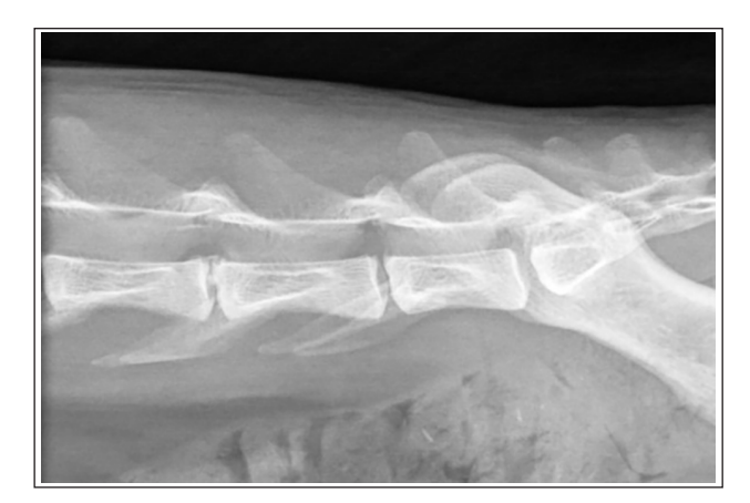
Figure 1 Right lateral radiograph of the hips containing the caudal lumbar spine revealing a narrowed L5–L6 intervertebral disc space, and a mineralised disc which is protruding dorsally into the vertebral canal

revealed narrowing of the L5–L6 intervertebral disc space. The L5–L6 intervertebral disc was also mineralised, slightly dorsally displaced and bulging into the ventral aspect of the vertebral canal. The hips were unremarkable, with adequate acetabular coverage of both femoral heads. A smoothly marginated bony spur was observed on the distolateral margin of the lateral malleolus of the fibula at the level of the tarsocrural joint. Smoothly marginated periarticular new bone formation was also seen bridging the plantar margin of the tarsometatarsal joint. The right stifle was normal.