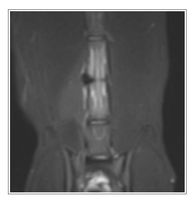
Figure 3 Dorsal short tau inversion recovery (STIR) at the level of the vertebral bodies of the lumbar spine, demonstrating a large volume of STIR hypointense material located right laterally at the intervertebral foramen. There is also a subtle hyperintensity of the surrounding epaxial musculature compared to the contralateral side

subsequent days. Medical therapy was instituted with meloxicam (0.05 mg/kg PO q24h [Metacam; Boehringer]) and gabapentin (~11 mg/kg [BOVA UK]).