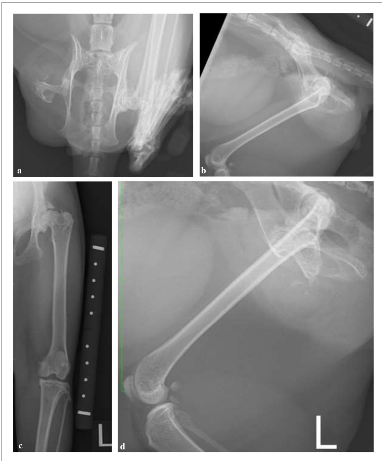
Figure 1 (a) Ventrodorsal and (b) lateral radiographs of the pelvis and femur, (c) craniocaudal horizontal beam, and (d) mediolateral radiographs of the left femur demonstrate marked periarticular osteophytosis of the coxofemoral joints compatible with a diagnosis of osteoarthritis