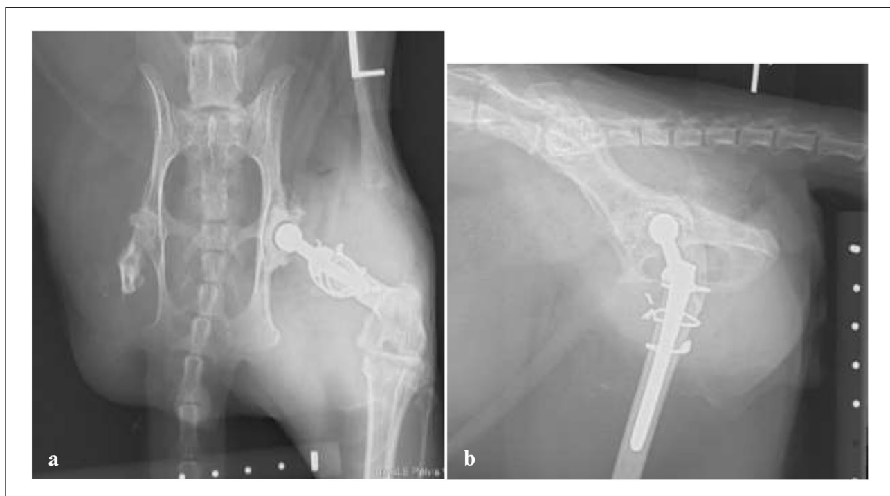
Figure 2 (a) Ventrodorsal and (b) lateral postoperative radiographs of the pelvis and femur demonstrate satisfactory postoperative implant positioning after left total hip replacement. Three cerclage wires are positioned around the proximal third of the femoral diaphysis to minimise the chance of fissure propagation

sole pelvic limb. 20,21 Similar studies are not available for cats. The altered mechanics of the contralateral hip in an amputee may influence clinical and radiological results after THR; however, there is limited literature concerning the outcomes and role of THR as a surgical option for amputee humans. 22