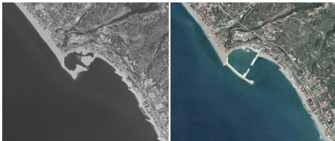
Figure 3. Aerial view of the Cetraro Port in 1988 before the dredging, and in 2000 after the dredging.