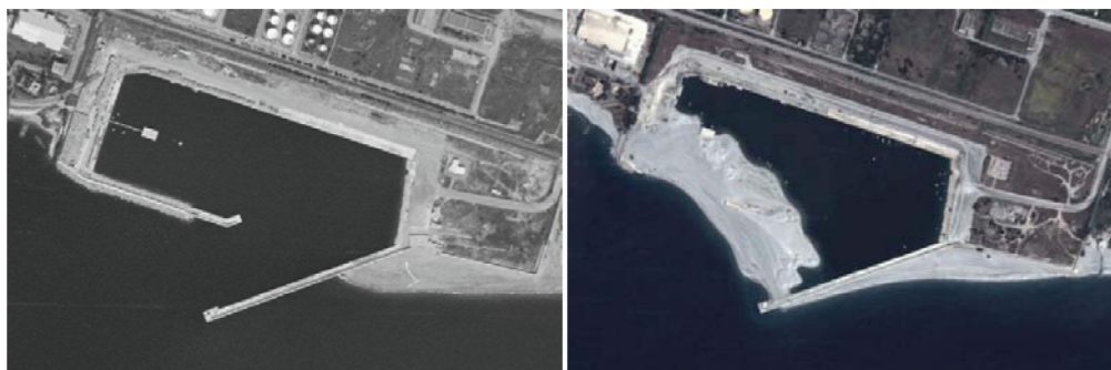
Figure 1. Aerial view of the Saline Joniche Port in 1984 and in 2013.

LST, set-up and wave run-up are the principal causes of coastal erosion and coastal flooding. The physical description and quantification of these phenomena are frequently carried out by means of simplified models. 3–8 Many times, all natural processes are influenced by urbanization which, through the construction of coastal structures, affects the natural evolution of the shoreline. 9 In these cases, it is important that a deep knowledge and investigation of the interaction between wave and structure is established in order to avoid the failure of an intervention. 10–14