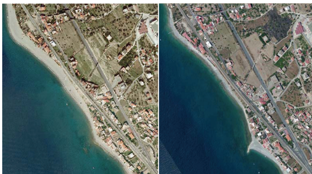
Figure 5. Aerial view of the groin in Lazzaro.