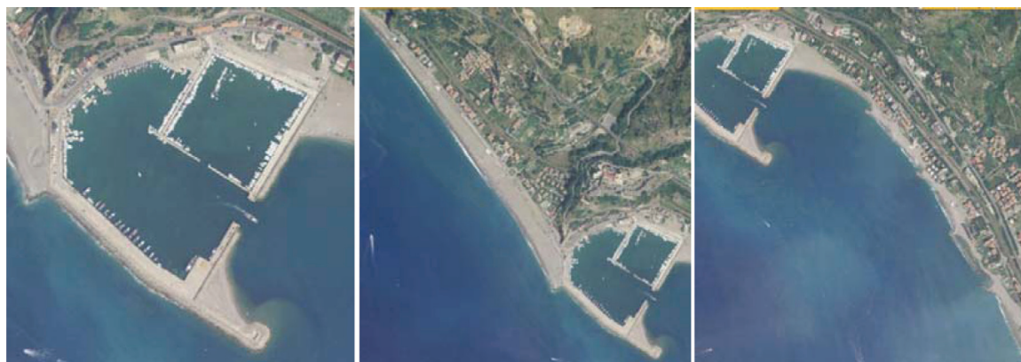
Figure 4. Aerial view of the actual situation of Cetraro Port, of the northwest side and of the southeast side.