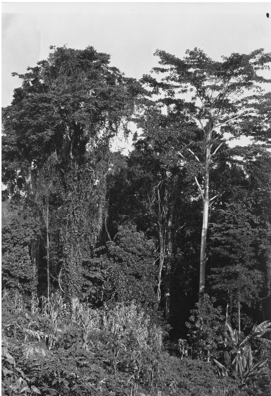
FIGURE 6. Edge of forest at Keku (AMNH negative no. 115594).