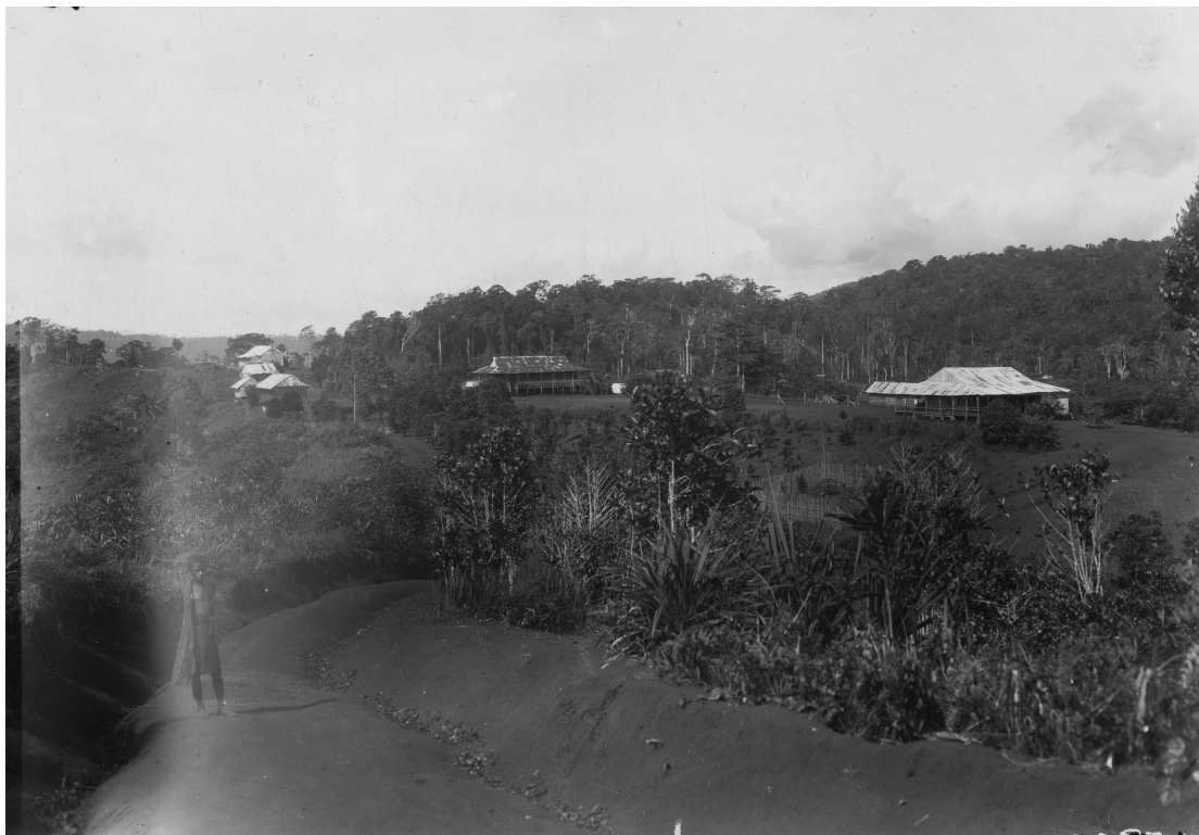
FIGURE 8. View of the surroundings at Wareo (AMNH negative no. 115801).

zigzagged up the sides of ridges to tracks across the narrow tops, with spectacular views of gardens on the steep hillsides. They arrived at Sevia, about 5000 ft, at 1 pm, just in time for the almost daily bank of fog to arrive (fig. 11). On one sunny afternoon, Beck followed a local trail to an elevation of 7500 ft. The summit of this ridge apparently marked the height of land in this part of the Cromwells, for the trail led downward to a village on the other side of the mountains. From these higher altitudes on sunny days the mountains of New Britain could be seen to the east.