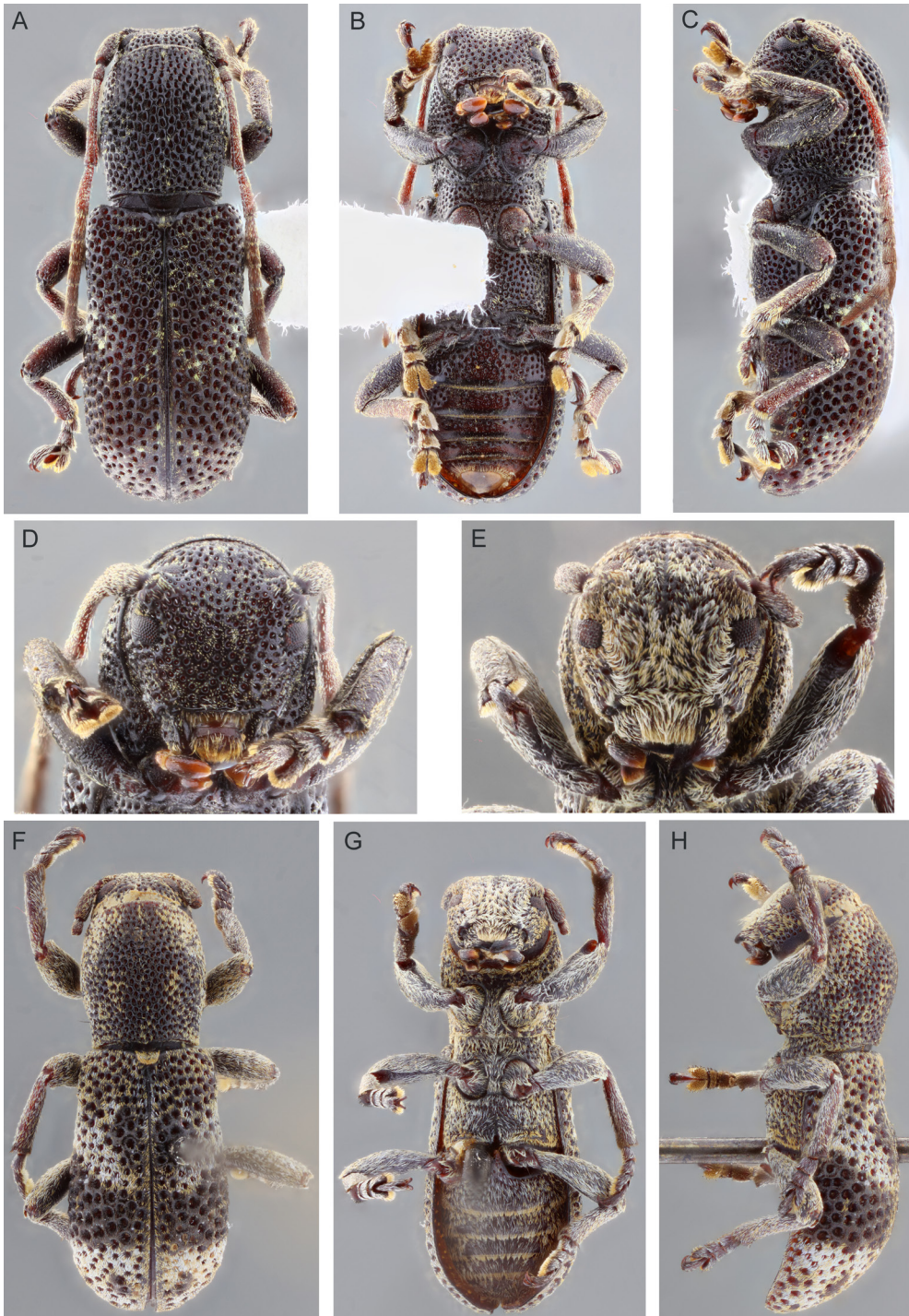
FIGURE 1. A–D. Morrisia skillmani , sp. nov., holotype male: A. Dorsal habitus; B. Ventral habitus; C. Lateral habitus; D. Head frontal view. E–H. Adaptera jejatama , sp. nov., holotype male: E. Head frontal view; F. Dorsal habitus; G. Ventral habitus; H. Lateral habitus.