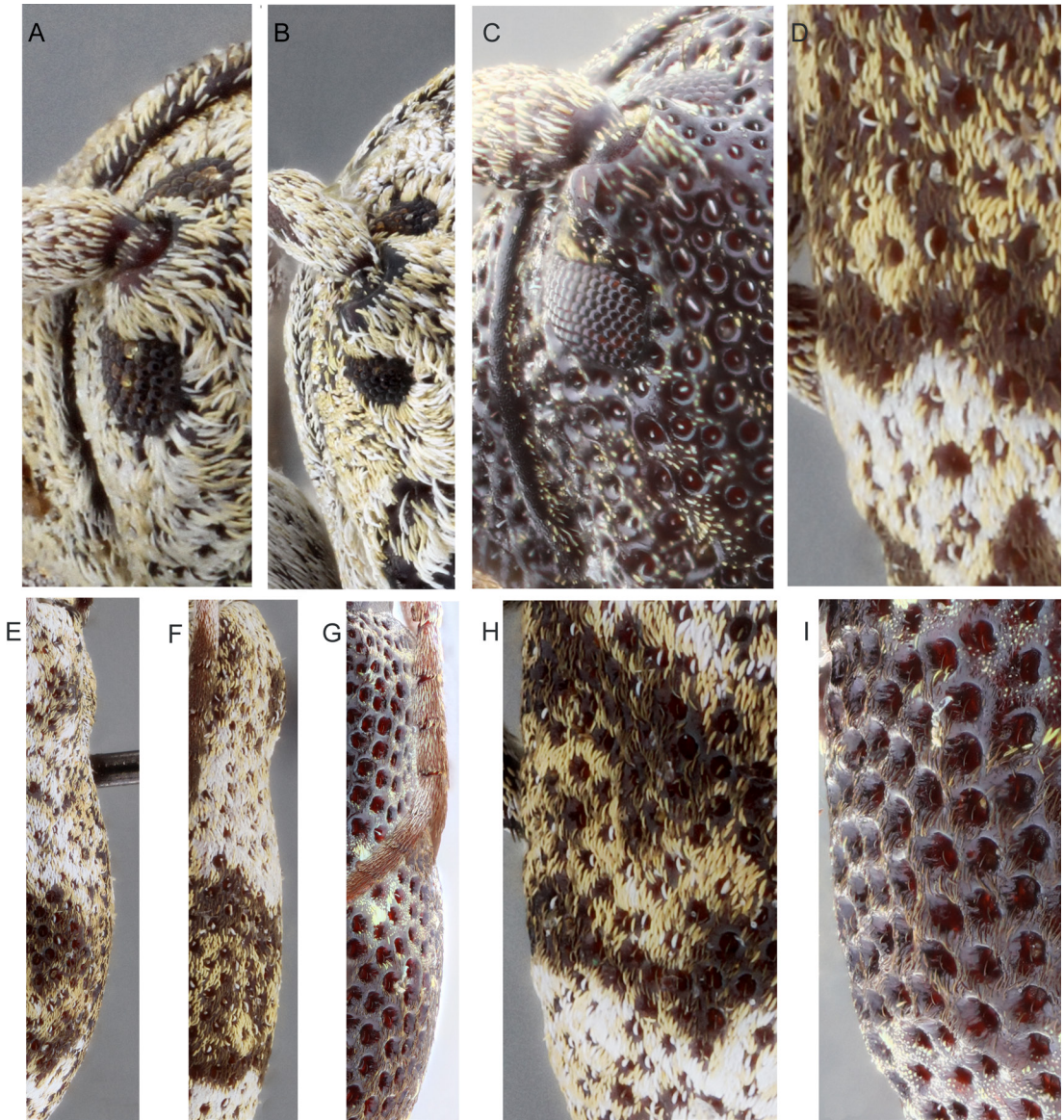
FIGURE 3. A–C. Eyes: A. Morrisia squamosa (Chemsak and Noguera, 1993), male; B. M. pulchra Santos-Silva et al., 2019, holotype female; C. M. skillmani , holotype male. D–F. Elytral curvature: D. M. squamosa , male; E. M. pulchra , holotype female; F. M. skillmani , holotype male. G–I. Elytral punctures on posterior half: G. M. squamosa , male; H. M. pulchra , holotype female; I. M. skillmani , holotype male.

decumbent, yellow and white setae not obscuring integument; apical third glabrous. Eyes almost divided; lower eye lobes with nine rows of ommatidia; distance between upper eye lobes 0.45\times distance between outer margins of eyes; in frontal view, distance between lower eye lobes 0.68\times distance between outer margins of eyes. Antennae missing antennomeres III–XI in left antenna; missing pedicel and antennomeres III–XI in right antenna; scape slightly widened basally, then subcylindrical toward apex, shorter than width between upper eye lobes, about