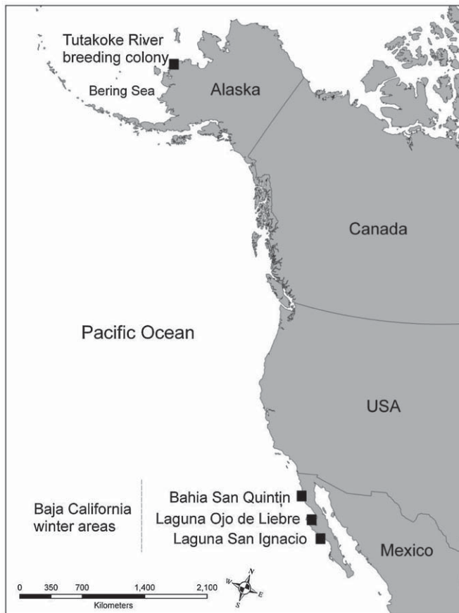
FIG. 1. Locations of the Tutakoke River Black Brant breeding colony in Alaska and three wintering locations in Baja California, Mexico.