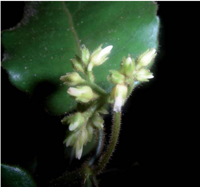
Fig. 2. – Inflorescence of Rinorea ranirisonii Nusb. & Wahlert. [Ranirison 496, P]

Remarks. – Rinorea ranirisonii is a distinctive species, yet it is not clear to which other opposite-leaved species in Rinorea subsect. Verticillatae it is most close related. With R. auriculata it shares a pedunculate cymose inflorescence (vs a contracted, subsessile inflorescence in most species), but is otherwise completely different in vegetative characters. R. ranirisonii differs from other species by the shape of its ovate leaf blade and the apex of the blade obtuse to rounded. It is also distinguished by its ovary covered in golden-reddish hispid indumentum, often densely so, as well as the young branches, upper and lower leaf surfaces, inflorescence axis, pedicels, and sepals.