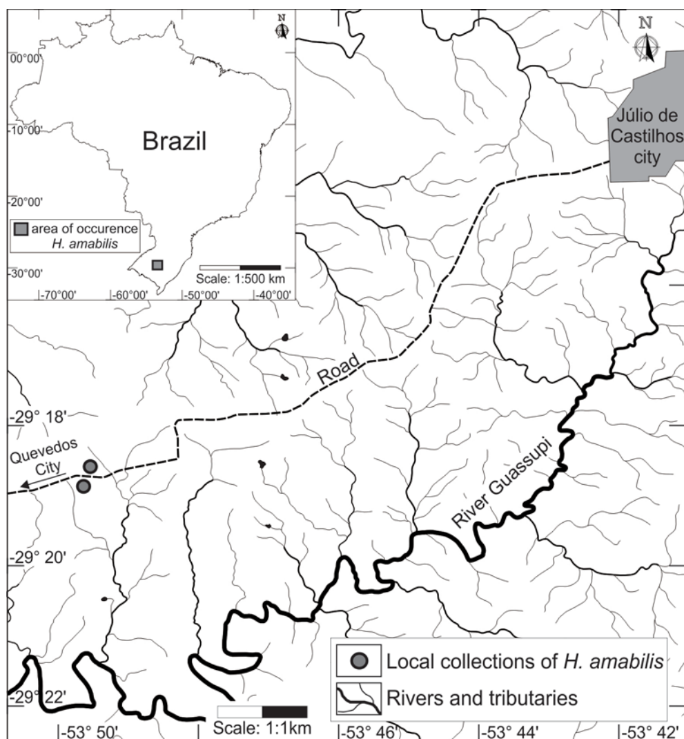
Fig. 3. – Geographical distribution of Herbertia amabilis Deble & F. S. Alves.