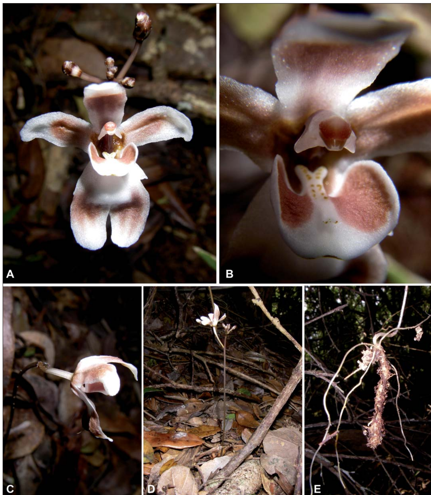
Fig. 2. – Didymoplexis avaratraensis P. J. Cribb, Nusb. & L. Gaut. A. Flower, front view; B. Labellum and column details, front view; C. Flower and pedicel, side view; D. Habit; E. Tuberous rhizome.

[Nusbaumer & Ranirison 1763] [Photo: L. Nusbaumer, 12.XII.2005]