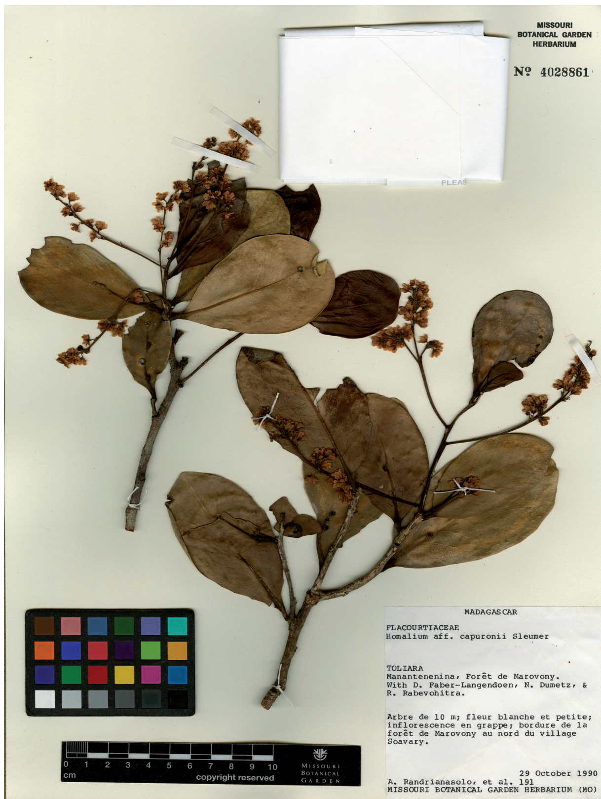
Fig. 4. – Holotype of Homalium randrianasoloi Appleg. [Randrianasolo et al. 191, MO]