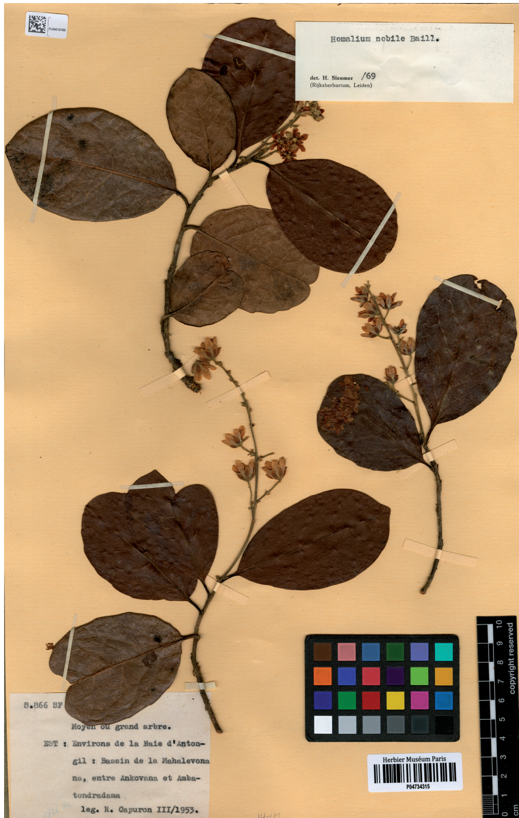
Fig. 3. – Holotype of Homalium pseudoboinense Appleg. [Service Forestier 8866, P]