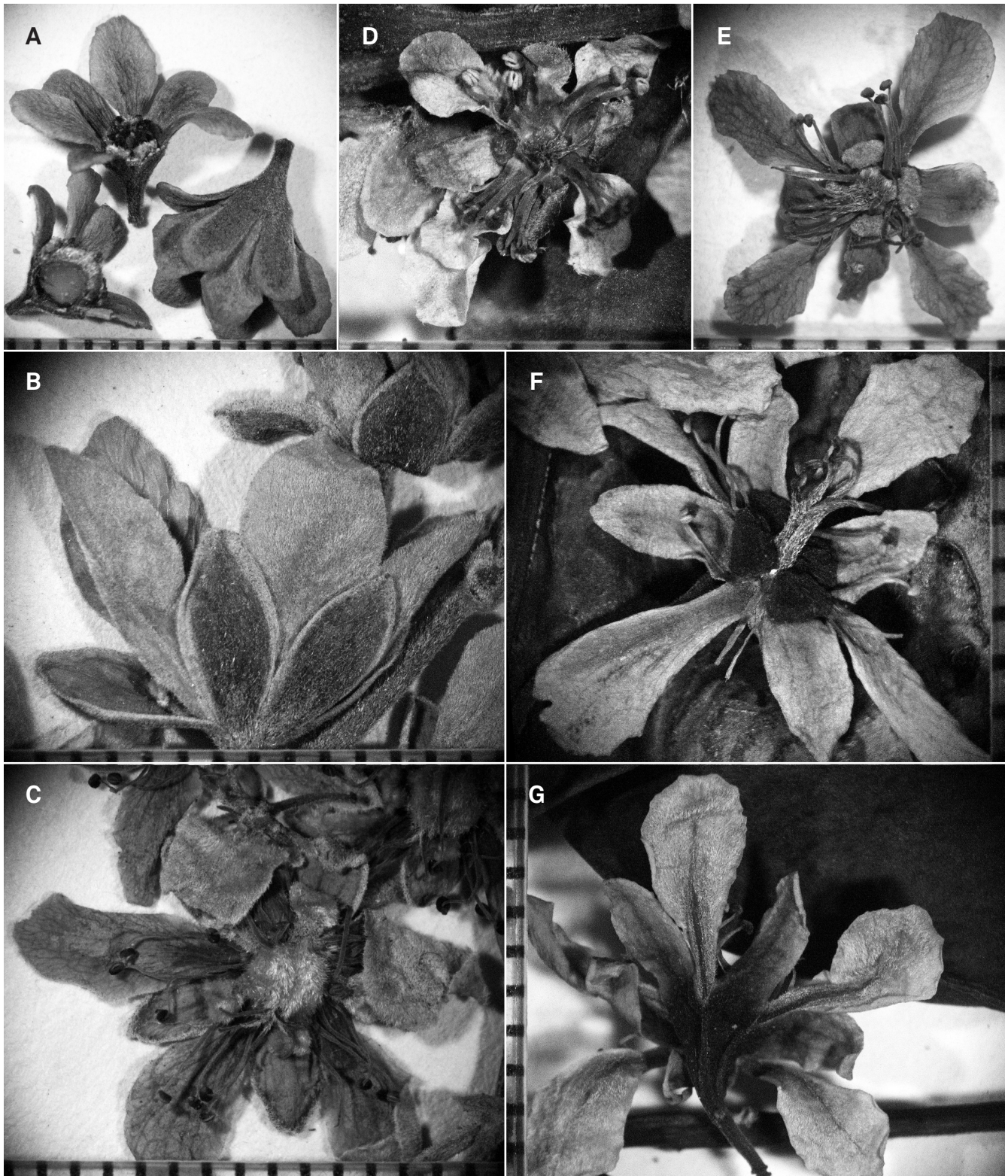
Fig. 2. – Flowers of newly described species of Homalium sect. Eumyriantheia Warb. A. Homalium dorrii Appleg.: flowers and nearly mature fruit with single seed; B. Homalium pseudoboïnense Appleg.: abaxial surface of perianth; C. Homalium pseudoboïnense : open flower; D. Homalium randrianasoloi Appleg.; E. Homalium ranomafanicum Appleg.; F. Homalium schatzii Appleg.: open flower; G. Homalium schatzii : abaxial surface of perianth.