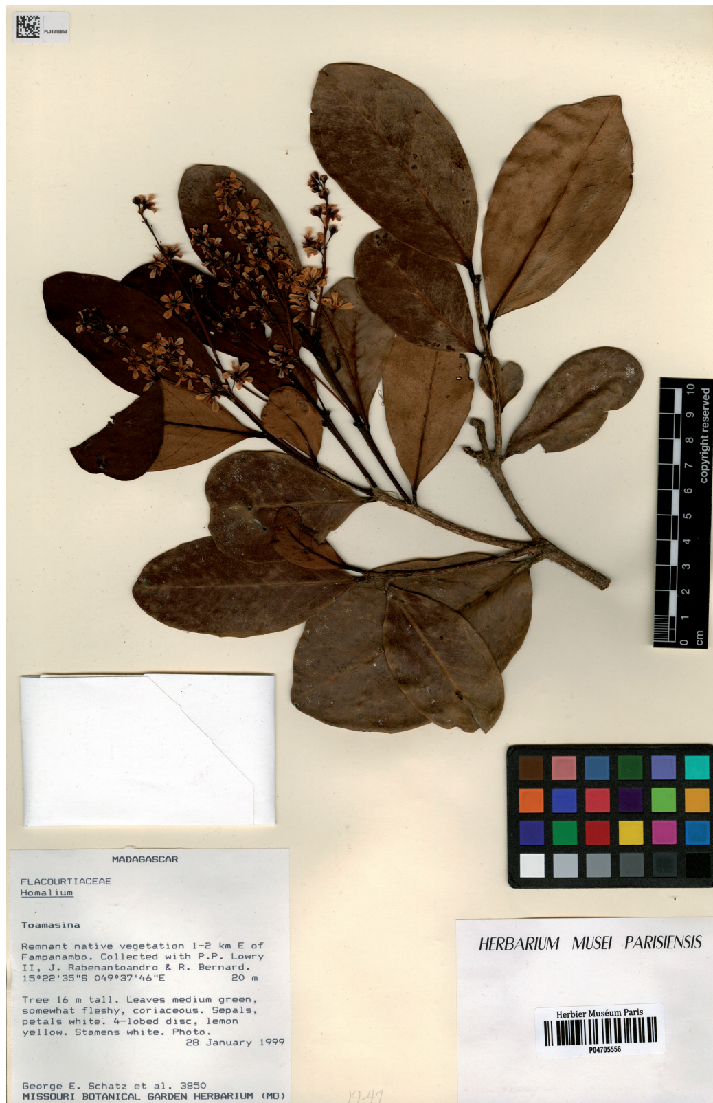
Fig. 6. – Holotype of Homalium schatzii Appleq. [Schatz et al. 3850, P]