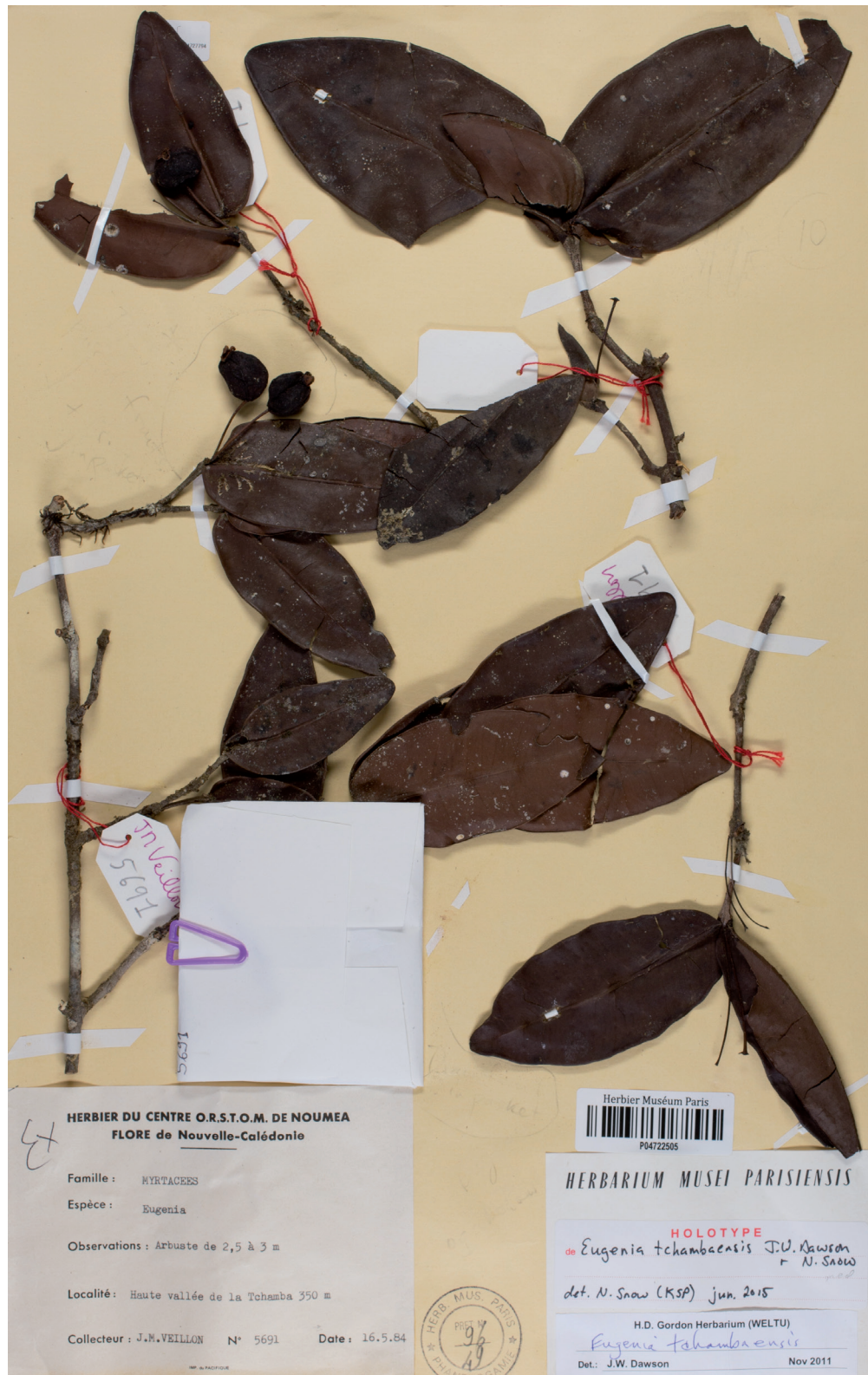
Fig. 5. – Holotype of Eugenia tchambaensis J.W. Dawson & N. Snow. [Veillon 5691, P]