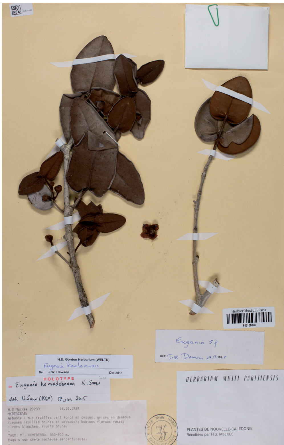
Fig. 3. – Holotype of Eugenia homedeboana N. Snow. [MacKee 20983, P]