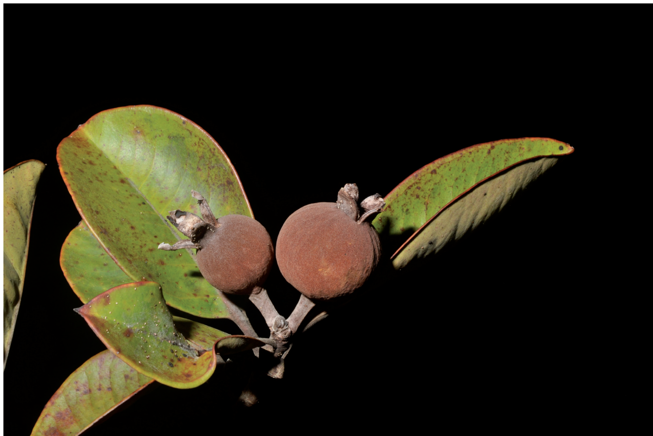
Fig. 7. – Fruiting plant of Eugenia veillonii N. Snow & Callm. [Callmander et al. 1241]