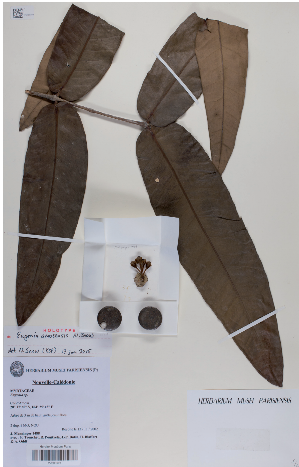
Fig. 2. – Holotype of Eugenia amosensis N. Snow.

[Munzinger et al. 1488, P]