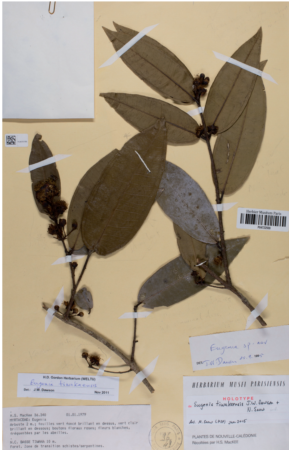
Fig. 6. – Holotype of Eugenia tiwakaensis J.W. Dawson & N. Snow. [MacKee 36340, P]