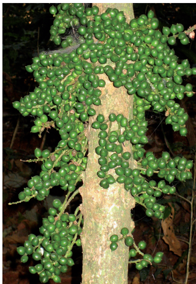
Fig. 1. – Maesobotrya barteri (Baill.) Hutch. from Guinea: stem with immature green fruits showing the woody bumps where the fruits grow from every fruiting season.

Shrub up to 4 m high with branches up to 4 cm in diam. Bark strongly fissured. Stipules paired, lanceolate, up to 8 × 1.5 mm, with appressed hairs along the edge and sometimes on