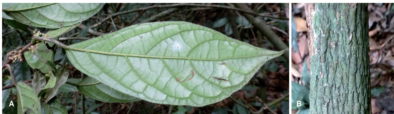
Fig. 3. – Maesobotrya liberica Jongkind. A. Leaf from below and male inflorescences; B. Stem c. 4 cm in diam. [Jongkind et al. 12943]

the outside along a line in between the edges, often persistent at younger nodes. Leaves alternate; petiole bipulvinate, 0.3–4.5 cm long, with short, more or less appressed, pale hairs; blade obovate to elliptic, 5.5–23.5 × 2.2–10 cm, acute at base, acuminate at apex, slightly bullate, the margin with small teeth each bearing a tuft of straight hairs, blade in bud completely covered with pale hairs, in the adult stage almost glabrous except for the midrib and the main lateral nerves below; 5–7 pairs of main lateral nerves. Male and female inflorescences axillary, usually solitary, racemose, rachis < 2 cm long, more or less appressed and pale hairy, bracts and bracteoles 1 mm or smaller, male with 7–18 flowers, female with 10–16 flowers. Flowers green, yellowish or reddish, with a joint in the pedicel close to the