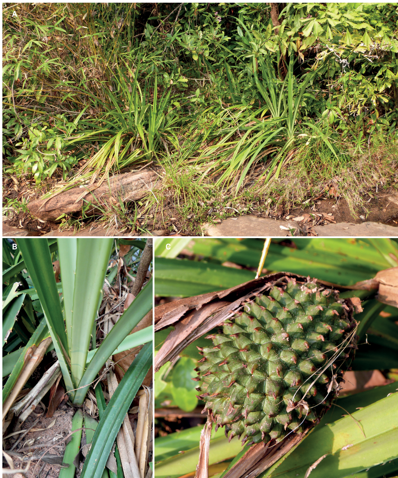
Fig. 2. - Pandanus voradolii Callm. & Buerki. A-B. Habit; C. Infructescence.