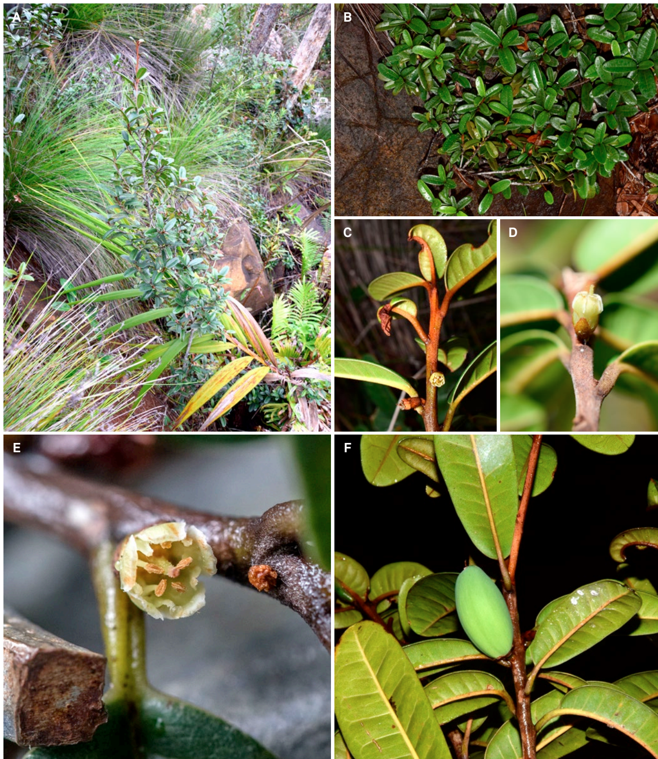
Fig. 2. – Pichonia munzingeri Gâteblé & Swenson. A. Overview of a single shrub; B. Decumbent shrub with leaves from above, resembling those of Pycnandra francii (Guillaumin & Dubard) Swenson & Munzinger; C–E. Sessile flower; F. Immature fruit.