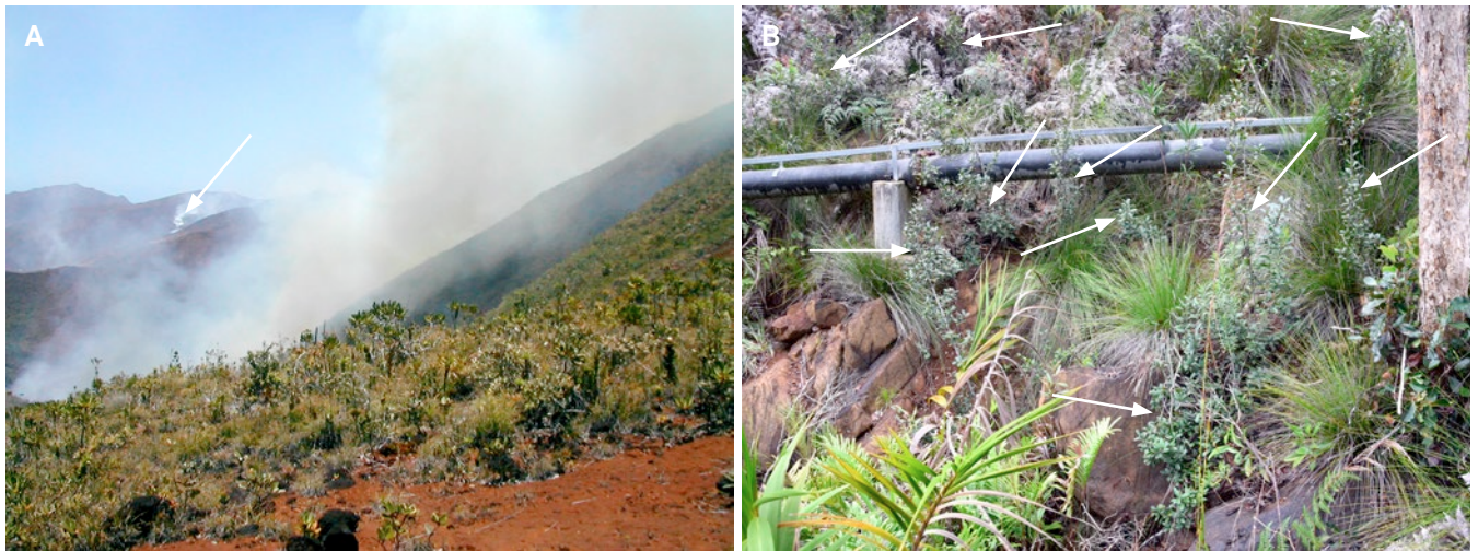
Fig. 1. – Pichonia munzingeri Gâteblé & Swenson. A. Overview of the Montagne des Sources fire on 29 December 2005, the arrow points to the fire in the Oumbéa creek; B. Upper population in degraded maquis vegetation showing Pteridium esculentum (G. Forst.) Cockayne flammable dead whitish fronds along the pipe to the water catchment, arrows point to ten individuals of Pichonia munzingeri .

Holotypus: NEW CALEDONIA. Prov. Sud: Mont-Dore, La Coulée, Captage de la Oumbéa, 21°11'19"S 166°34'22"E, 150 m, 14.III.2018, fl., Gâteblé & Rochard 1011 (P [P001156237]!; iso-: G [G00341841]!, MO!, MPU!, NOU [NOU089084]!, S [S18-39759]!).