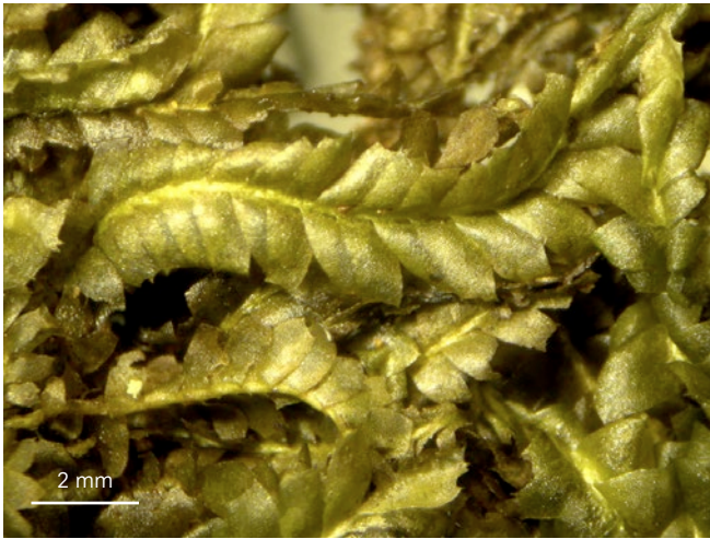
Fig. 1. – Chiloscyphus parapilistipulus Thouvenot: habit, dorsal view. [Thouvenot NC2451]

distal angles, to shallowly bifid, lobes short, widely triangular, minutely apiculate, some leaves with rounded apices. Leaf cells hexagonal, isodiametric to slightly elongate, 44–66 \mu\text{m} long, 25–52 \mu\text{m} wide, walls thin without trigone. Underleaves small, not or hardly wider than the stem, overall oval, deeply bifid, disc wider than long, 3–4 cells high, insertion line semi-circular, lateral margins with a small obtuse tooth on both sides, teeth sometimes linear, lobes erect or crescent shaped, narrowly lanceolate acuminate to linear, sinus lunate. Sexual condition dioicous. Gynoecia (unfertilized), terminal on very short intercalary ventro-lateral branches without vegetative leaves or underleaves, bracts oval, 1.2–1.8 mm long, bifid, lobes ovate acute, a lanceolate segment usually developed on the upper part of a single lateral margin otherwise entire or with rare small teeth, bracteole deeply bifid, 1.5 mm long, lobes narrowly lanceolate, more or less convergent, margins entire, perianth 2–2.5 mm long, cyathiform, smooth, mouth tri-lobate, lobes deeply laciniate. Androecia not seen.