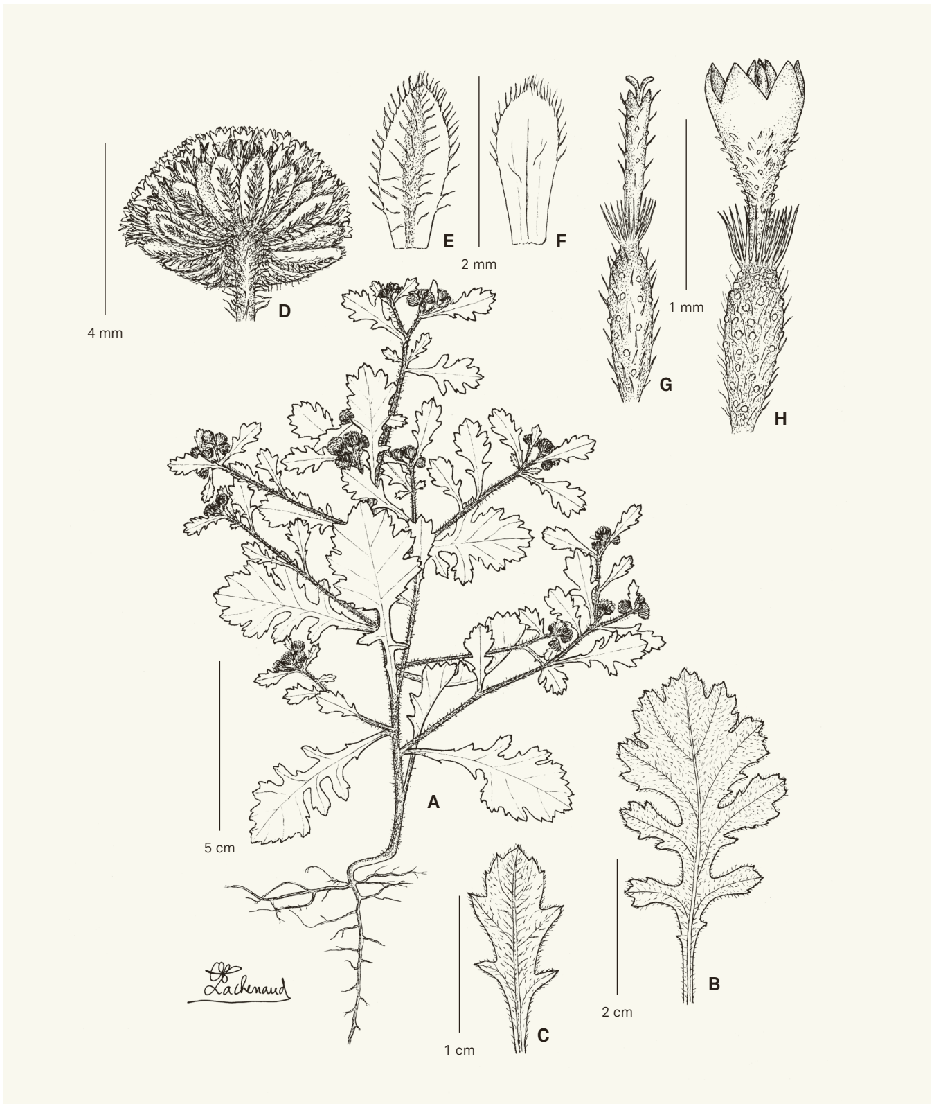
Fig. 2. – Grangea ogoouensis O. Lachenaud & Beentje. A. Plant in flower; B. Basal leaf; C. Upper leaf; D. Capitula; E. Outer phyllary; F. Inner phyllary; G. Outer (female) floret; H. Inner (hermaphrodite) floret. [Bidault et al. 1822, BR] [Drawing: O. Lachenaud]