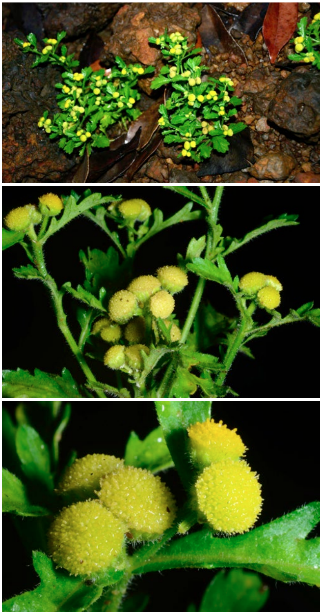
Fig. 1. – Grangea ogoouensis O. Lachenaud & Beentje. A. Entire plant in habitat; B. Capitula and upper leaves; C. Capitula. [Bidault et al. 1822]

0.15–0.3 mm long; inner florets many, bisexual, funnel-shaped, corolla 0.8–1.3 mm long, of which the lobes 0.2–0.3 mm, with a few hairs (and sometimes a few glands). Achenes 3-angular or (?when young) flattened, 0.8–1.2 mm long, slightly pilose, with a few glands; the outer with caducous pappus of 6–16 bristles 0.2–0.3 mm long; the inner with pappus of 12–18 slightly broad-based bristles 0.3–0.6 mm long.