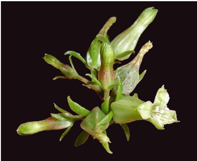
Fig. 1. – Close-up of flowers of Kalanchoe apiifolia D.-P. Klein, Shtein & Callm. [Rakotovao et al. 2327]