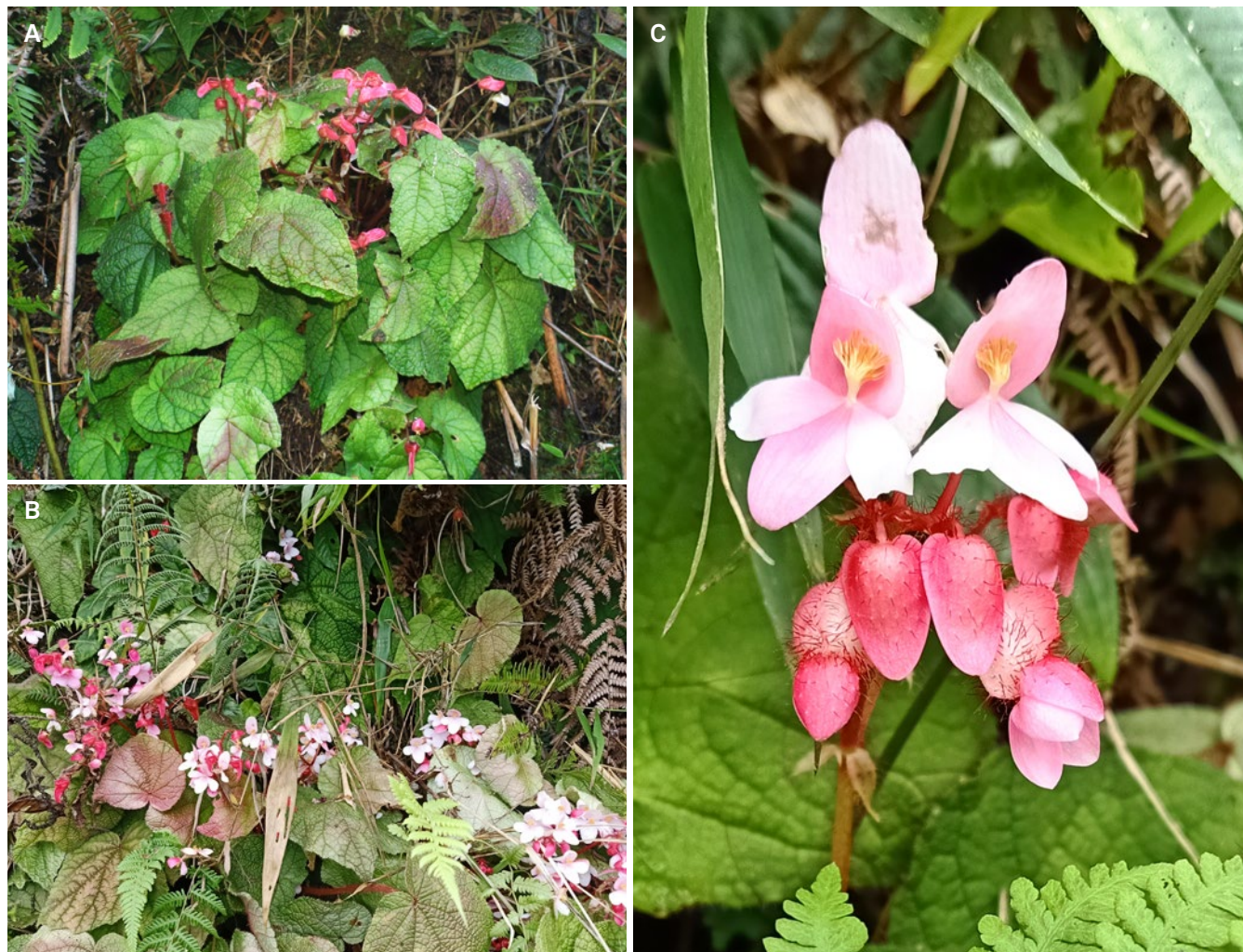
Fig. 2. – Begonia egamii D. Borah, Taram & M. Hughes. A, B. Habitat; C. Detail of staminate flowers showing the unusual asymmetric androecium.

Flowers from November to December, fruiting from December to January.