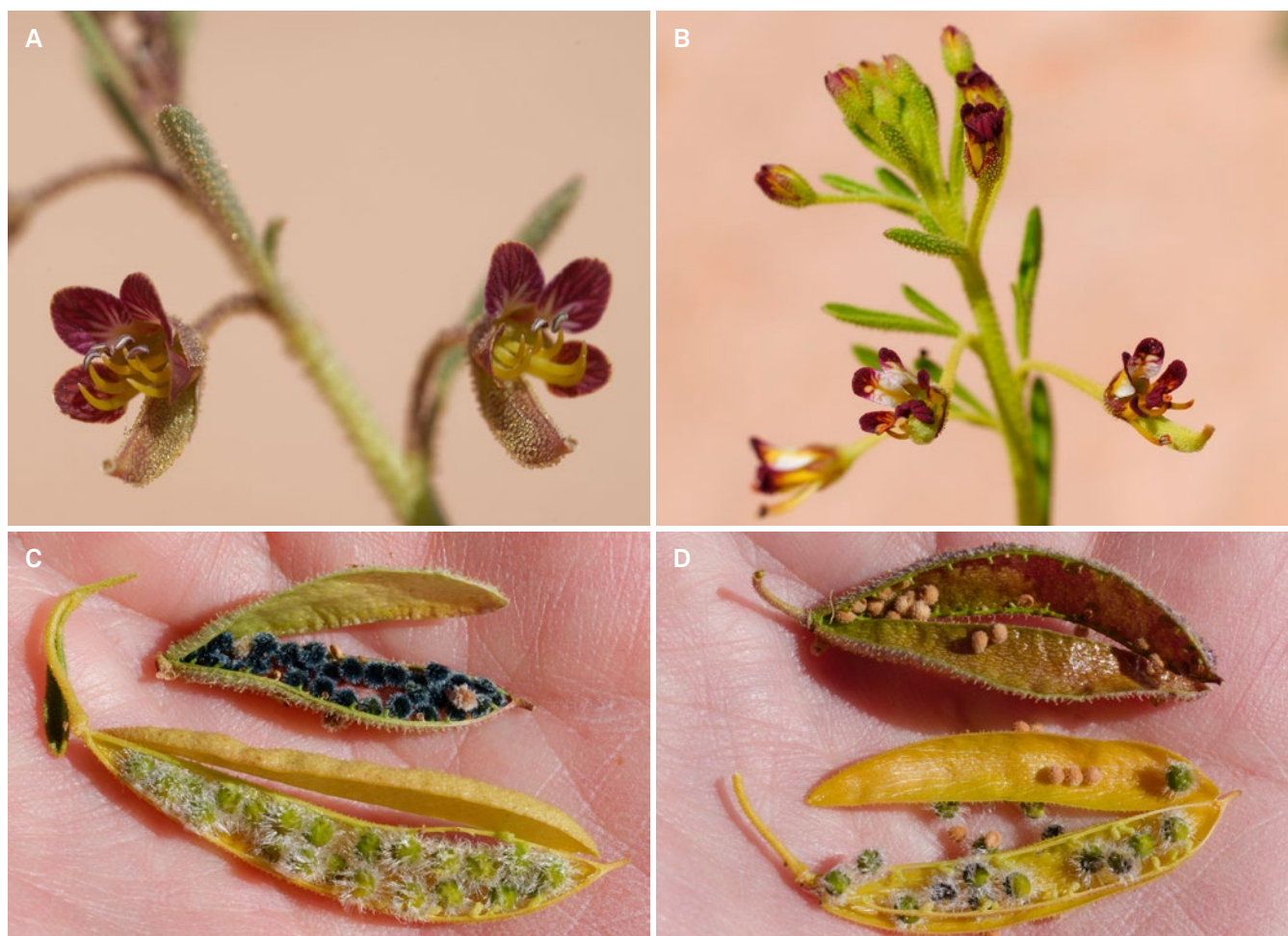
Fig. 1. – A. Flowers of Cleome amblyocarpa Barratte & Murb. var. amblyocarpa ; B. Flowers of C. amblyocarpa var. glandulosa (Forssk.) Botsch.; C–D. Fruits of C. amblyocarpa var. amblyocarpa (up) and C. var. glandulosa (Forssk.) Botsch. (down).