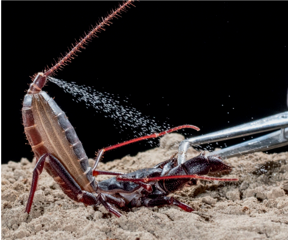
Figure 1.—A vinegaroon spraying its acid containing chemical defense on a threatening attacker (forceps).

vinegaroons (Eisner et al. 1961) and free-living first instar nymphs avoiding the odor of large wolf spiders (Punzo 2005). This paucity of knowledge is partly because vinegaroons are strictly nocturnal creatures that do not fluoresce like scorpions, are not attracted to lights, are dark colored, and are slow moving, making them difficult to study. We report here on field observations and laboratory experiments to determine the breadth of prey that vinegaroons accept, what predators they are likely to encounter, and how various sizes of immatures and adults might behave to minimize risks of predation or cannibalism.