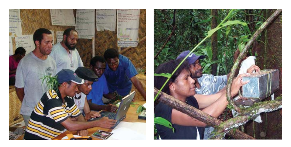
Students of the University of Papua New Guinea combine the collection of field data with computer statistical analysis during a field course in Herowana, in the Crater Mountain Wildlife Management Area (left) and at Gulf Province, Papua New Guinea (right). University courses, undertaken in partnership with the Wildlife Conservation Society, focus on field data collection, biological analysis, and technical report writing.

to notify and manage tiger reserves.... Such provisions are needed for all protected areas. However, there are also some aspects of the amendments that may undermine certain essential conservation provisions of the existing act, so these need to be reviewed."