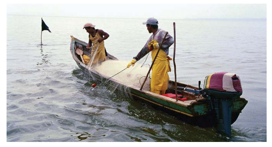
In the vicinity of the Patiño Reserve in Panama, artisanal fishers fish in the Gulf of San Miguel, in the Pacific coast's Darién Province. The government has restricted part of the Gulf of San Miguel to artisanal fishing and prohibits industrial shrimp trawling, although enforcement of the trawling ban is questionable. Sport fishing is allowed in another area of the Darién coast, where artisanal fishing activity is largely restricted.