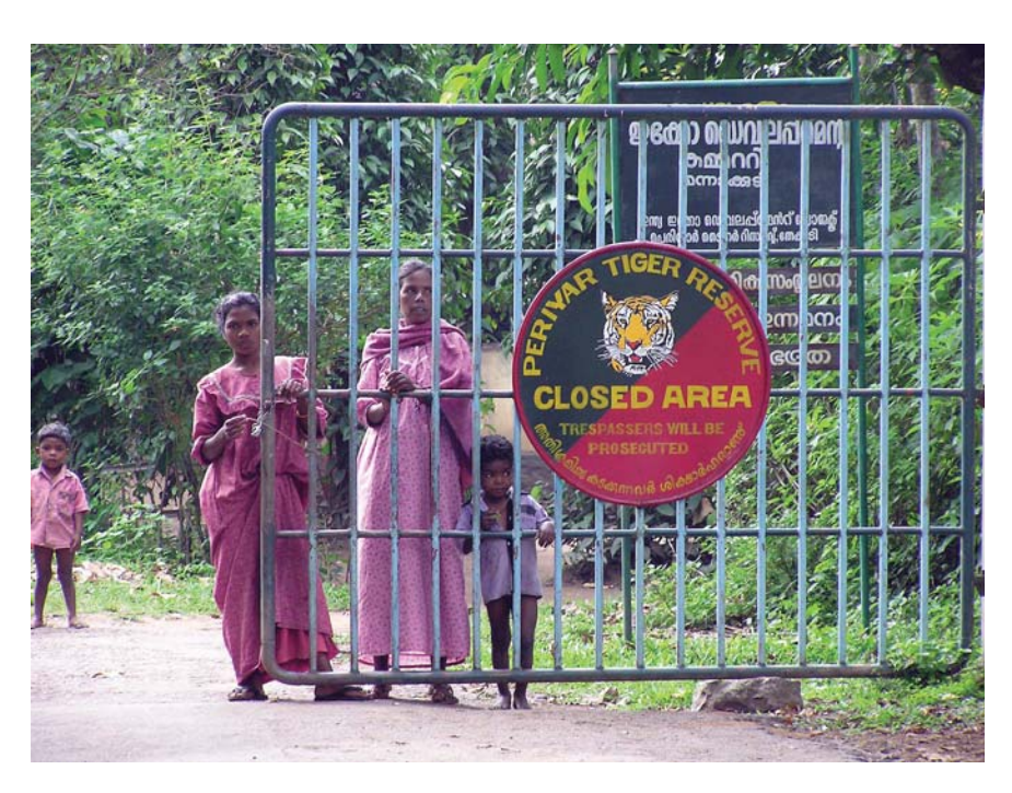
In a vivid evocation of what critics term "guns and fences" policies for protected areas, gates at the Periyar Tiger Reserve in the southern state of Kerala serve as a clear boundary against local people's access. However, equity relations are changing at the reserve, as formerly marginalized indigenous peoples play a growing role in conservation and consultation regarding reserve policy.

Protecting areas to preserve biodiversity raises equity concerns for local and indigenous peoples. Conservationists and peoples' rights advocates are often at odds, whether miscommunicating or working in direct opposition. Policies for simultaneously safeguarding cultural and biological diversity can be achieved.