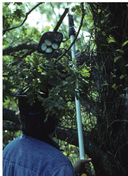
On shore, citizen scientists use mirrors attached to poles to see inside the nests and count the number of eggs and chicks of shorebirds on islands in the Boston Harbor.