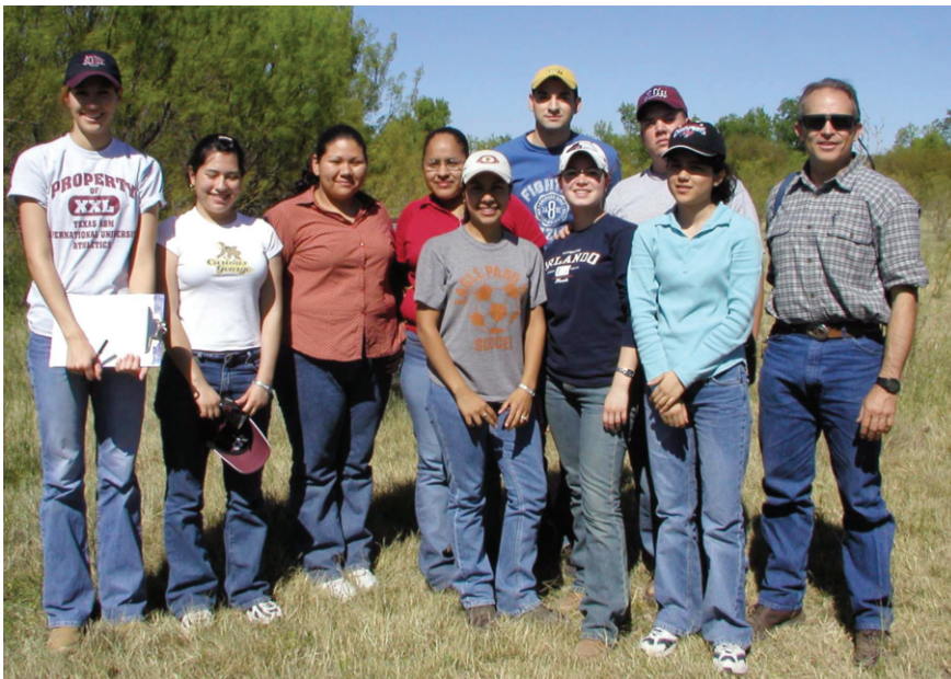
High-school students monitoring monarch butterfly larvae at Rio Bravo Park in Texas pause for a group photo. The monitoring project includes more than 600 sites from Minnesota to Texas and east to the Atlantic Coast.