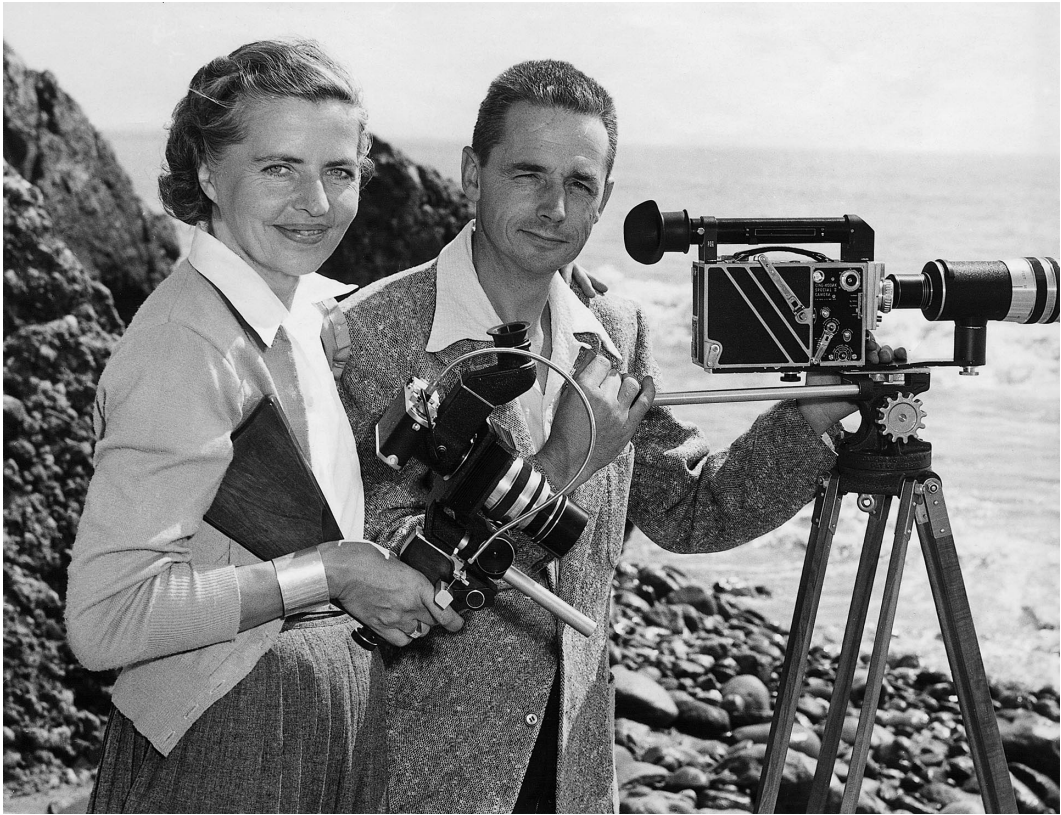
OLIN SEWALL PETTINGILL JR., 1907–2001

(Posing with Eleanor for publicity photo-shoot by Disney Studios in Santa Monica Beach, California, just prior to their departure for the Falkland Islands in October, 1953.)