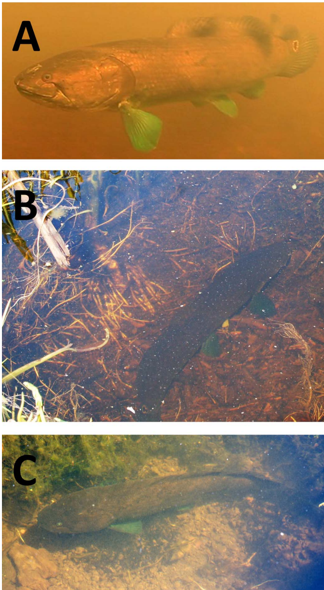
Fig. 1. Roving and guarding male bowfin in spawning coloration. (A) Male swimming in Big Bay Creek, New York. Note bright green fins and the prominent ocellus on the caudal peduncle, both characteristic of spawning coloration. (B) Male lying on constructed nest with stripped roots. (C) Male guarding fry on his nest. Black fry are seen in contrast to the brown substrate and are in a round patch underneath the male from approximately the snout to just anterior to the pelvic fins.

We found these newly hatched larvae to be very cryptic. On the nest, the male guards the eggs, and hatched fry (about 7 mm long), for about eight to ten days (Reighard, 1903). Wriggling and actively swimming fry are jet black and highly visible (Fig. 1C). After eight to ten days, the male will venture from the nest with his ball or traveling school of black fry (Fig. 2D), which, by that stage, are about 11–12 mm or larger (Reighard, 1903). Males continue to care for fry until they are as much as 100 mm long (Reighard, 1903; Forbes and Richardson, 1908).