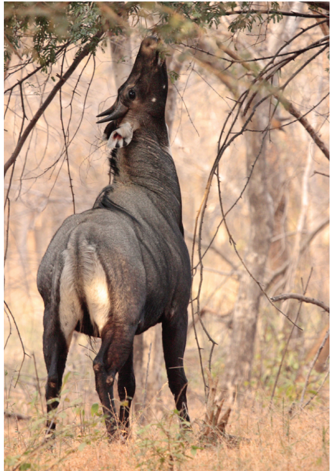
Fig. 5. —Male Boselaphus tragocamelus reaching for leaves of woody vegetation in Ranthambore National Park, Rajasthan, India, December 2004; browse is seasonally important in the diet in India and southern North America; note the characteristic “hogmane” at base of the neck.

Maximum life span is 12–13 years in the wild (Berwick 1974; Mungall 2000; Mungall and Sheffield 1994) and 20–21 years in captivity (Grzimek 1990; Jones 1982); 1 female born at the National Zoo, Washington, D.C., lived 21 years and 8 months (Weigl 2005). Survival patterns among male and female B. tragocamelus are similar to those of other ungulates (Brown 1976) but vary depending on population density and status of particular populations, either on native or introduced range (cf. Berwick 1974; Sheffield et al. 1983). High rates of mortality are common for males in particular, but also females, before age 3 (Berwick 1974; Brown 1976). In Gir Forest, India, 34% of calves die each year, and there is a general linear decline of 52% of 2–10-year-olds of both sexes (Berwick 1974). In southern Texas, mortality of both