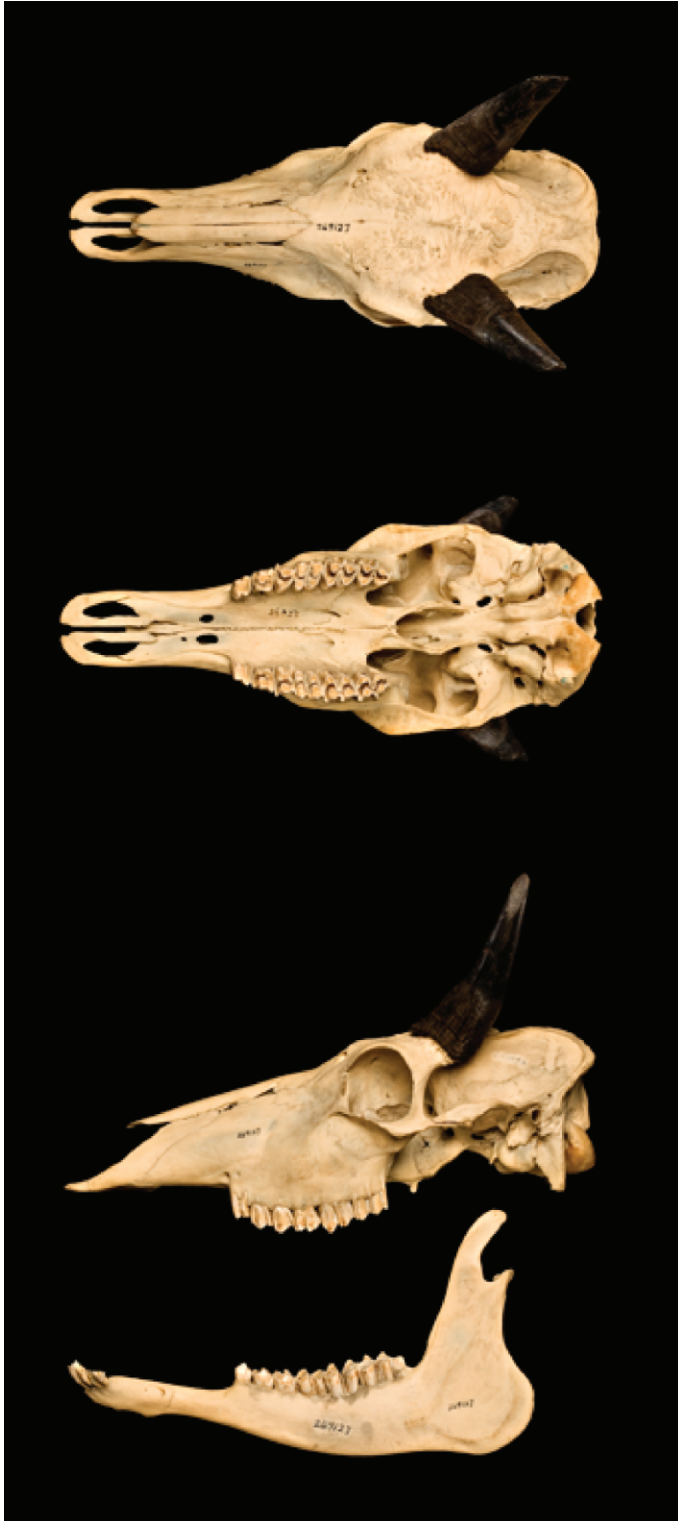
Fig. 3. —Dorsal, ventral, and lateral views of skull and lateral view of mandible of adult male Boselaphus tragocamelus (National Museum of Natural History, specimen 269127). Greatest length of skull is 376 mm.