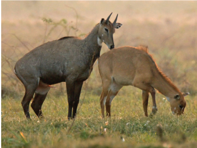
Fig. 6. —Premounting behavior of Boselaphus tragocamelus in Koleado National Park, western India, December 2004.

often at distances of > 75 m between conspecifics (Fall 1972; Sheffield et al. 1983). Threats are more serious than dominance displays and include a straight-necked threat displayed frontally and usually \leq 10 m from a conspecific (while stationary, walking, or running toward opponent) and rush threat from a normal stance or after a lateral display with lowered neck, head toward the ground, and horns horizontal (contact and goring of the thighs or flank are common, and chases of \leq 750 m have been observed—Fall 1972; Sheffield et al. 1983). While displaying, males may circle one another crouched and with a stiff posture (Cowan and Geist 1961; Fall 1972).