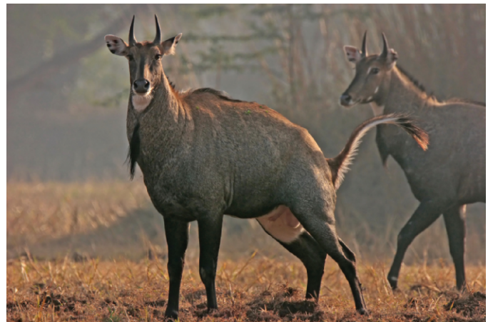
Fig. 1. —Male Boselaphus tragocamelus in characteristic defecation posture (foreground), Koleado National Park, western India, December 2004; note beard below the white gular patch and short, pointed horns, both unique to males.

Antilope tragocamelus Pallas, 1766:5. Type locality unknown; name based on zoo specimen from "Bengal [= northeastern India] from a very remote Part of the Mogul's Dominions" (Parsons 1745:465).