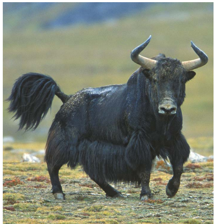
Fig. 1. —Mature male wild yak ( Bos mutus ) in Yeniugou, central Qinghai, China.

Gauribos Heude, 1901:3. No type species selected; said to include G. laosiensis , G. brachyrhinus , G. sylvanus , and G. mekongensis .